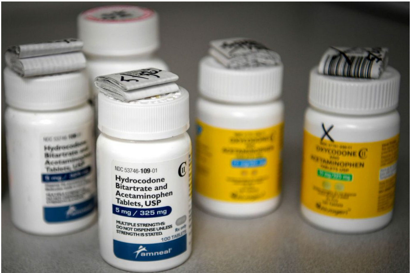
Bottles of opioid-based medication at a pharmacy in Portsmouth, Ohio

The foundation of human flourishing — dignified participation in and labor for a stable community — should be the shared basis of social life, rather than the aspirational perks of a high-powered career.