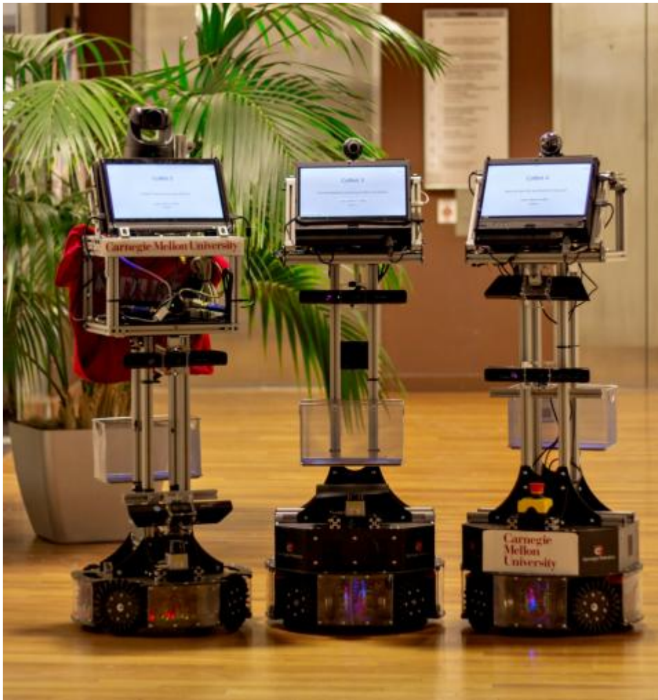
Three of the autonomous mobile CoBots developed at Carnegie Mellon University

Solutions floated to address the coming workforce disruption run the gamut. Retraining and education programs, whether funded by companies or government, are a common proposition. Tesla CEO and SpaceX founder Elon Musk is among those calling for government officials to proactively regulate artificial intelligence, sharing Hawking's view that without it the technology poses " a fundamental risk to the existence of civilization. "