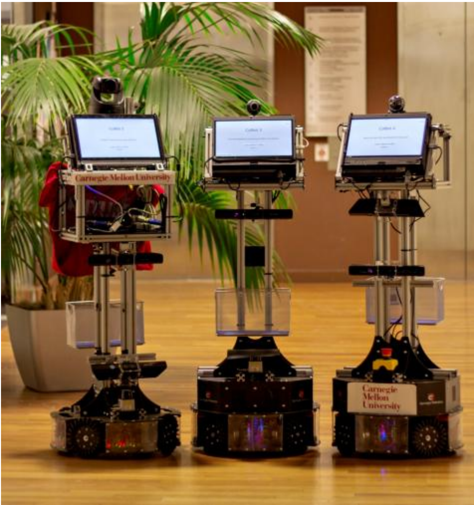
Three of the autonomous mobile CoBots developed at Carnegie Mellon University

Solutions floated to address the coming workforce disruption run the gamut. Retraining and education programs, whether funded by companies or government, are a common proposition. Tesla CEO and SpaceX founder Elon Musk is among those calling for government officials to proactively regulate artificial intelligence, sharing Hawking's view that without it the technology poses " a fundamental risk to the existence of civilization. "