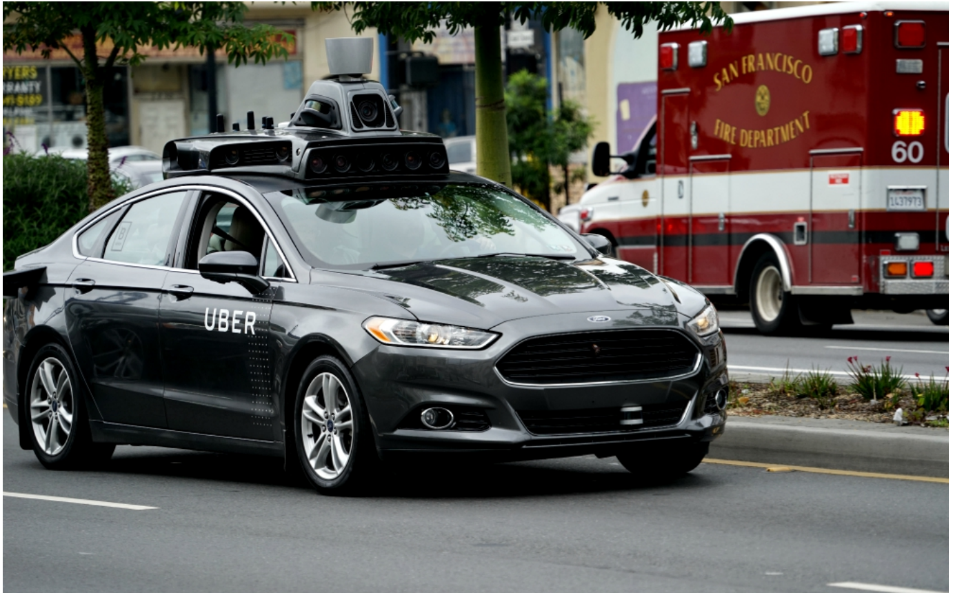
An Uber autonomous vehicle prototype is spotted in San Francisco in November 2016.

Thirty-eight percent of U.S. jobs are at risk of automation by the early 2030s, according to a March analysis by consulting firm PricewaterhouseCoopers . Another study from the private nonprofit National Bureau of Economic Research estimated that between 1990 and 2007, each robot introduced into a local workforce eliminated six human jobs. A January report from McKinsey Global Institute projected that fewer than 5 percent of jobs were at risk of full automation, though nearly every occupation could see impacts of some level.