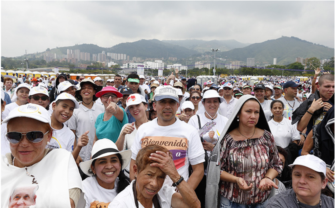
People attend Pope Francis' celebration of Mass at Enrique Olaya Herrera Airport in Medellin, Colombia, Sept. 9.

The Mass celebrated the feast day of St. Peter Claver, a 17th-century Spanish Jesuit missionary in Colombia known for his ministry to African slaves.