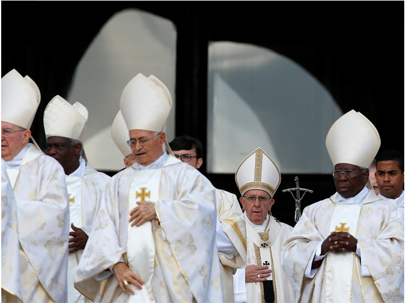
Pope Francis arrives to lead a Mass for the Jubilee for Priests at St. Peter's Square at the Vatican on June 3, 2016.