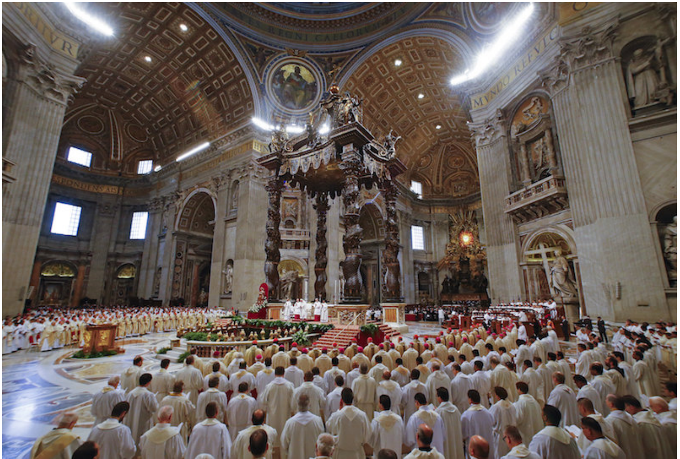
Pope Francis leads the Chrism Mass in Saint Peter's Basilica on March 24, 2016.