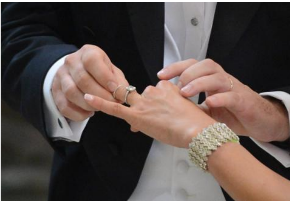
A couple gets married in Stockholm, Sweden, in this 2013 file photo.

"No one can be condemned forever, because that is not the logic of the Gospel!" he exhorted.