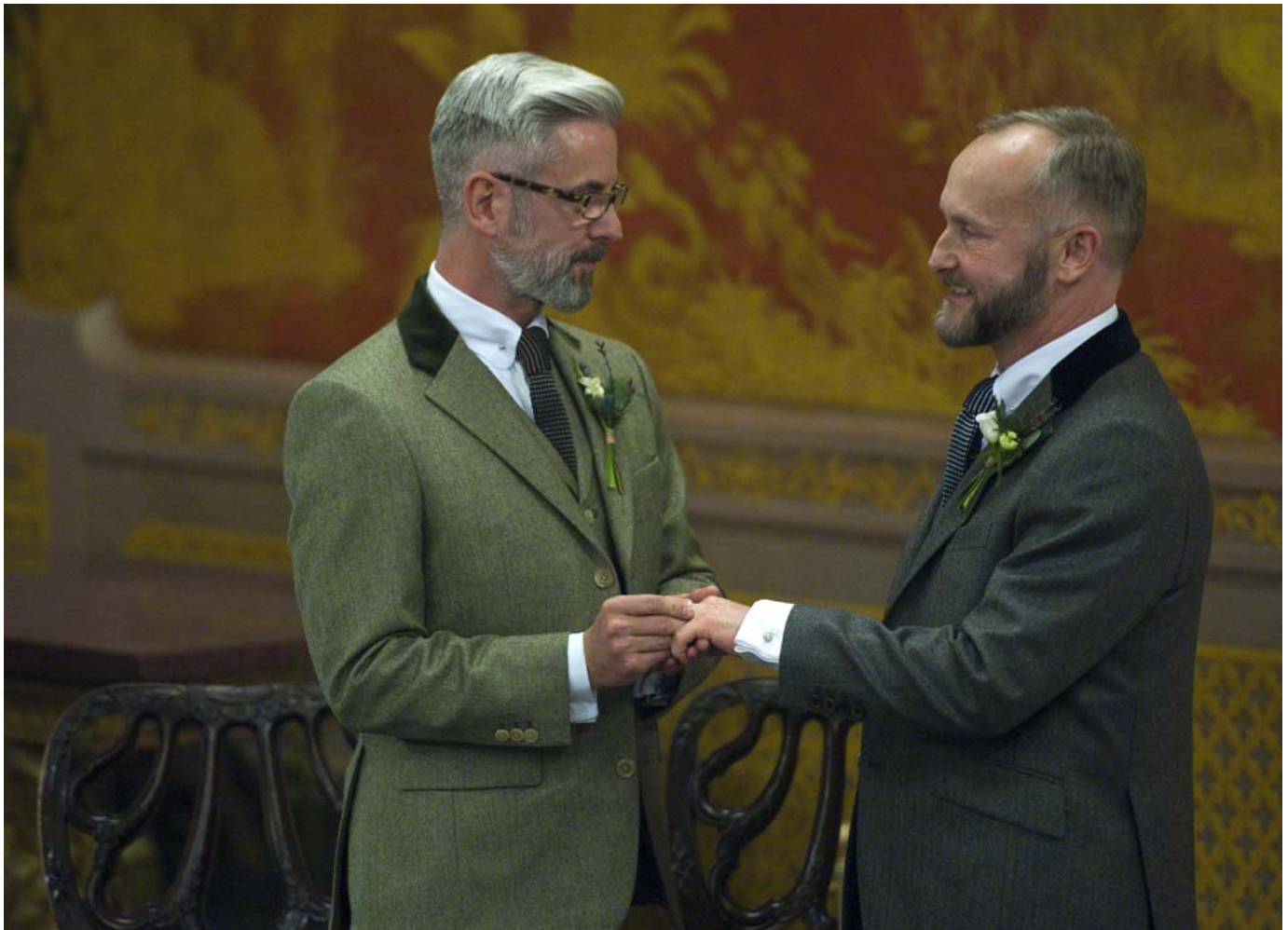
A same-sex couple exchange rings during their marriage ceremony in 2014 in Brighton, England.

The pope also said the church has sometimes had a hard time in the past respecting what lay Catholics discern God to be telling them in their consciences.