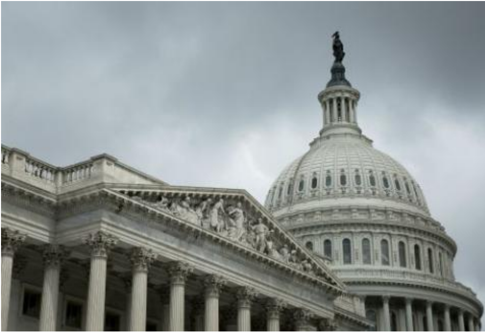
The U.S. Capitol in Washington

The extent of the alliance between Buchanan's mind and Koch's money takes several chapters to tell. I do not want to give the whole story away — I want you to buy the book, read it, and share it with a friend. But if you think this is just all so much interesting, albeit scary, history, think again. Think of the crisis in Flint, Michigan, a direct outgrowth of the Koch-funded Mackinac Center, which first began the push for state-appointed city managers with no accountability to the electorate. Think of the disinformation campaign about climate change and its success: "The number of Americans who believed that 'continued burning of fossil fuels would alter the climate' dropped from 71 percent in 2007 to 44 percent in 2011." Think of the efforts to suppress voter participation that have created a fake issue — voter fraud — to justify restrictions on the franchise that disproportionately harm the poor. Through the American Legislative Exchange Council and the State Policy Network, both funded by Koch, the radical vision of a polity organized not around shared rights of citizenry but around property rights made sacrosanct is being implemented from Wisconsin to North Carolina. And their special focus on races for judgeships may be the least noticed, but most consequential, direct involvement in electoral politics.