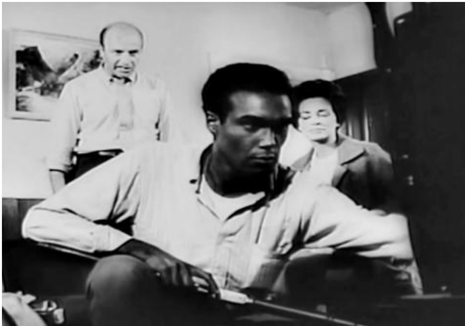
Duane Jones, center, as lead character Ben in George Romero's 1968 film "Night of the Living Dead"

Those darker impulses echo original sin, he claims, but they also serve as foils to other characters, who recall the good Samaritan and his willingness to help others despite his personal safety. If the appearance of zombies is understood to represent the Fall, those good Samaritans provide some hope for redemption, both within the narrative and in the real, tumultuous world.