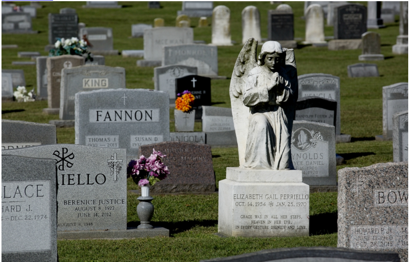
St. Mary Parish's cemetery in Alexandria, Virginia