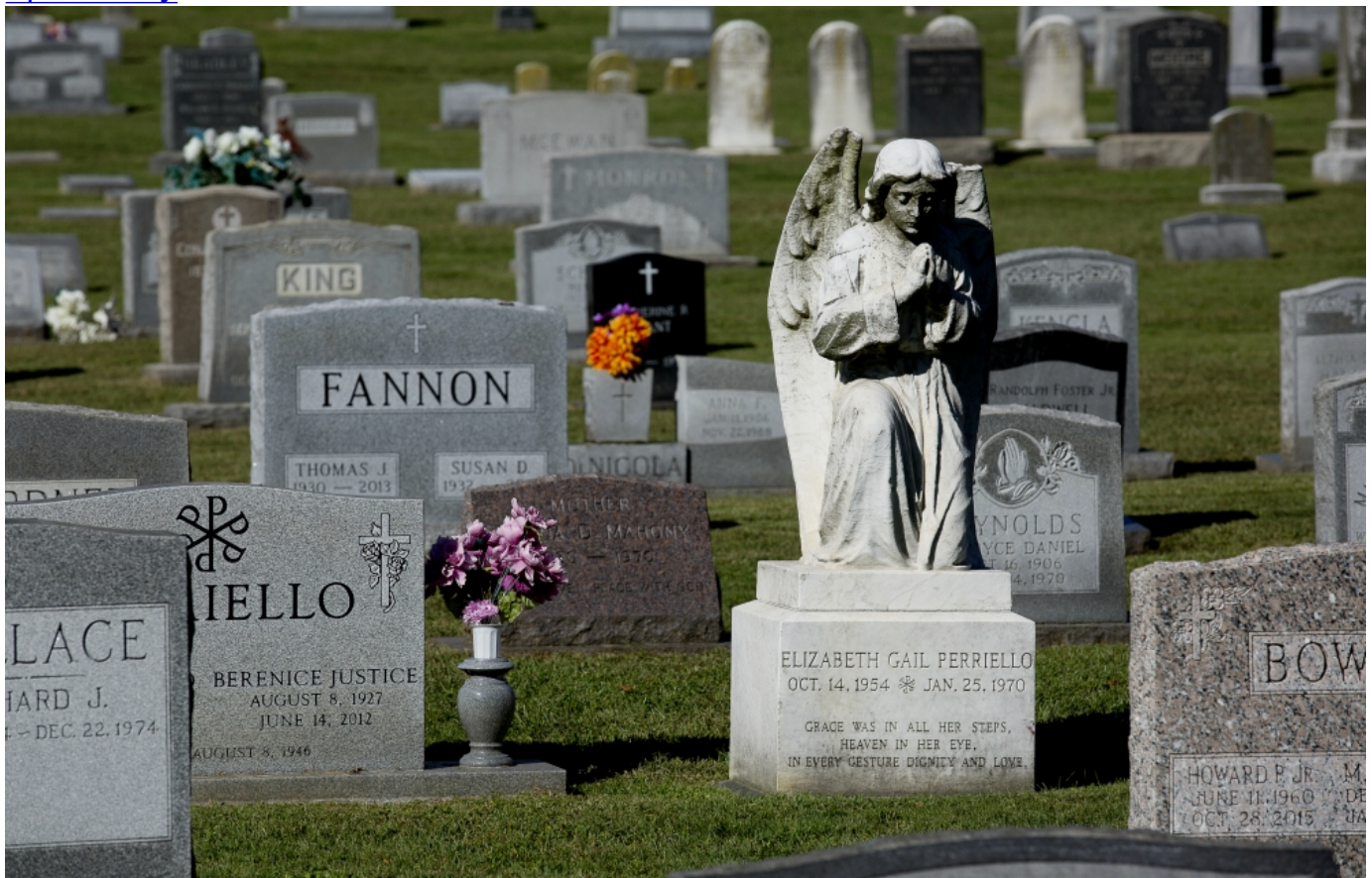
St. Mary Parish's cemetery in Alexandria, Virginia