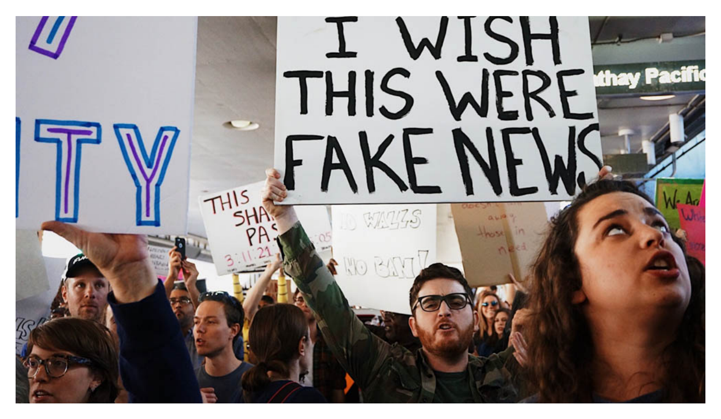
Photo taken at a protest against President Donald Trump's travel ban, at Los Angeles International Airport

even to promote readers or increase clicks. It's very challenging in our society to be truthful and trust that others are truthful."