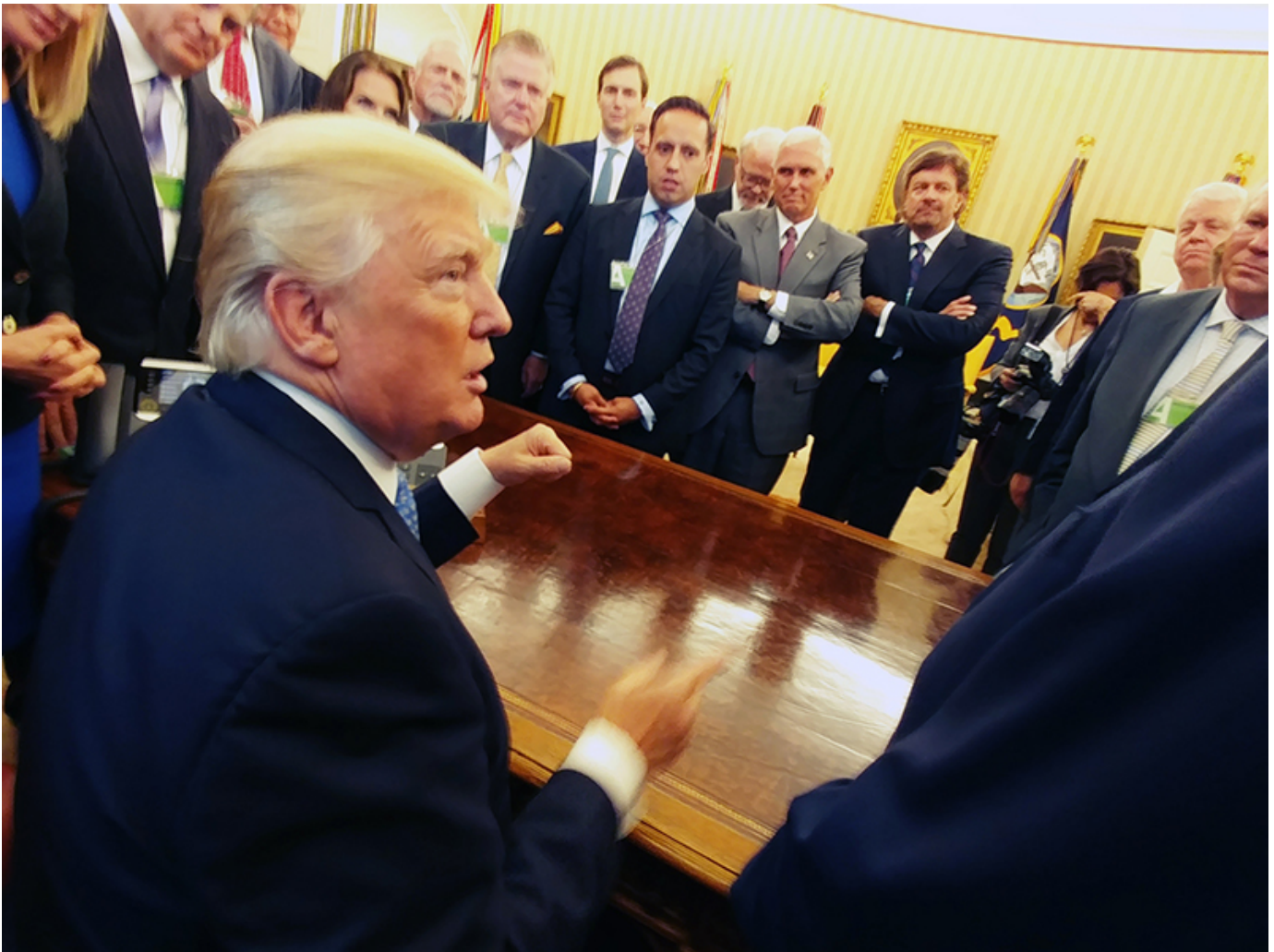
President Trump meets with faith leaders inside the Oval Office on May 3, 2017.