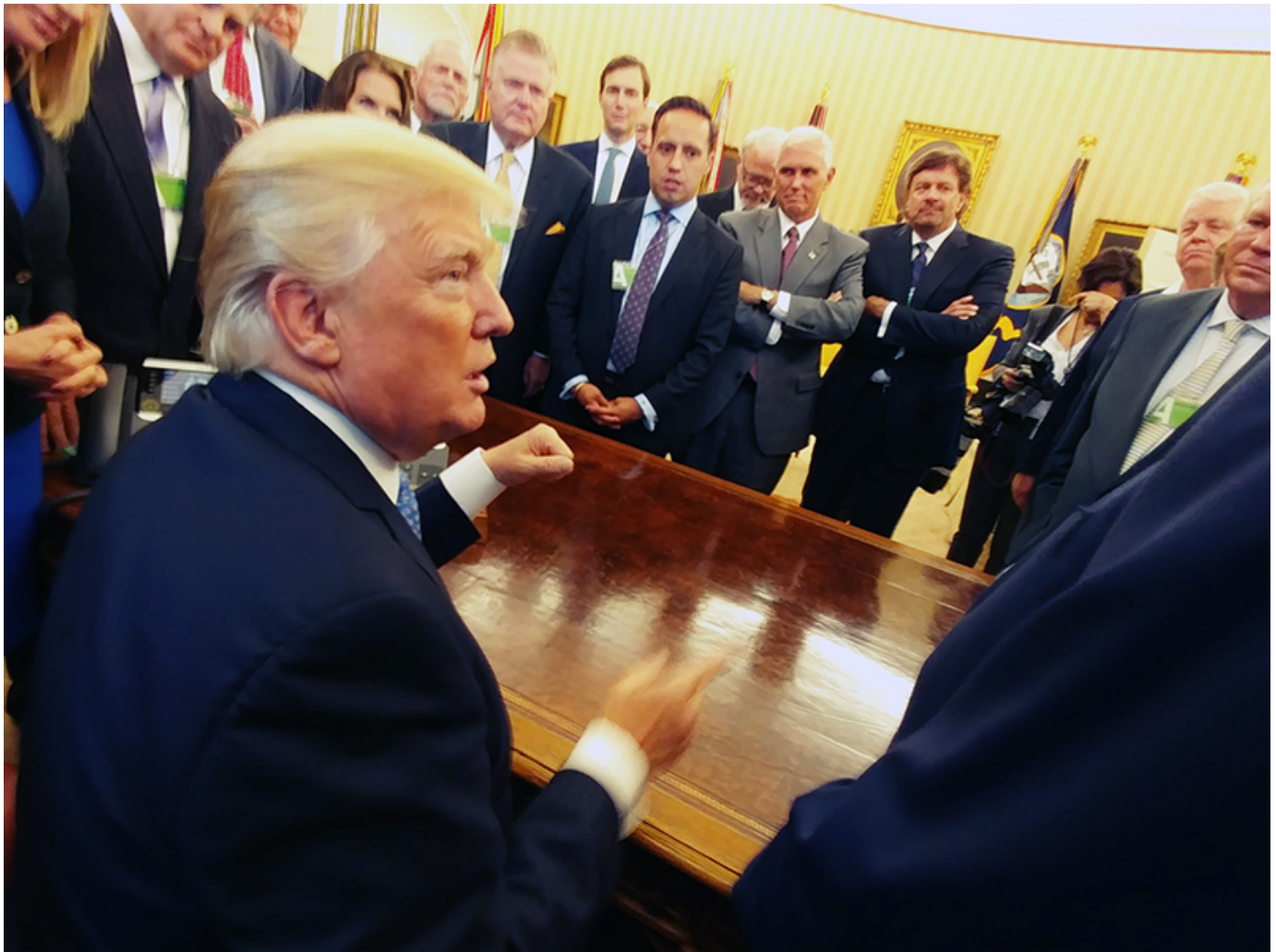
President Trump meets with faith leaders inside the Oval Office on May 3, 2017.