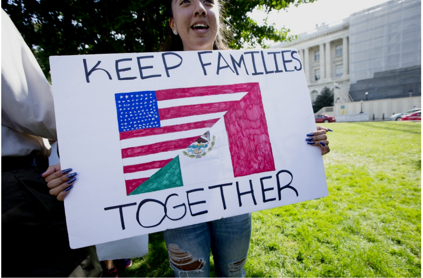
A participant at an immigration rally is seen near the U.S. Capitol in Washington Sept. 26, 2017.