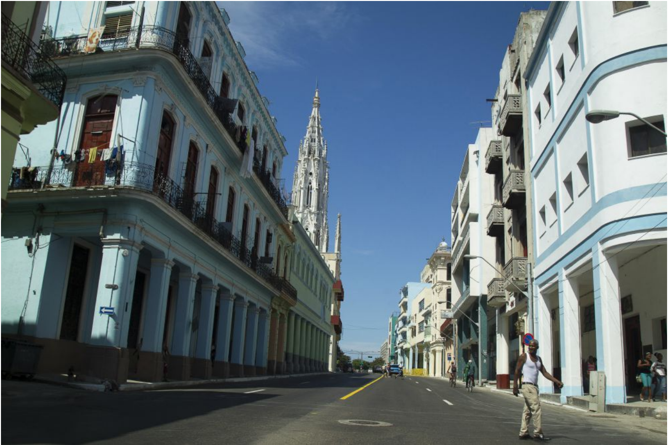
A man walks near the Church of the Sacred Heart of Jesus in Havana Sept. 19, 2015.

Many seemed shocked by the evident poverty and shortages faced by most Cubans. "Nobody lives on $30 per month," noted our guides, referring to the government's official average monthly wage. They were quick to point to a quasi-"underground" economy in which even doctors and university professors supplement their wages as tour guides, baristas, maids and drivers. Several home owners offer hospitality to tourists, a Cuban version of the Airbnb business model. Coveted construction jobs are plentiful, too.