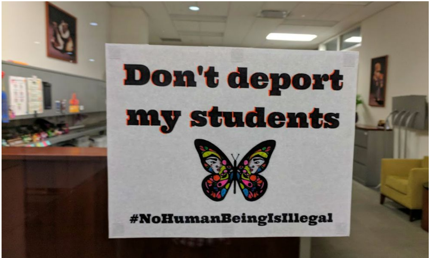
A poster at the library at Loyola Marymount University