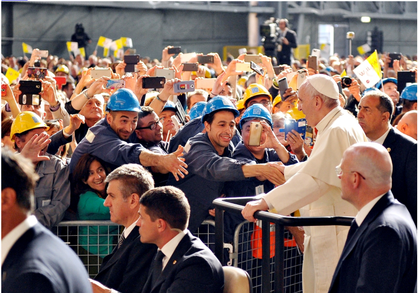
Pope Francis greets workers as he arrives at the ILVA steel plant during a May 2017 pastoral visit in Genoa, Italy.