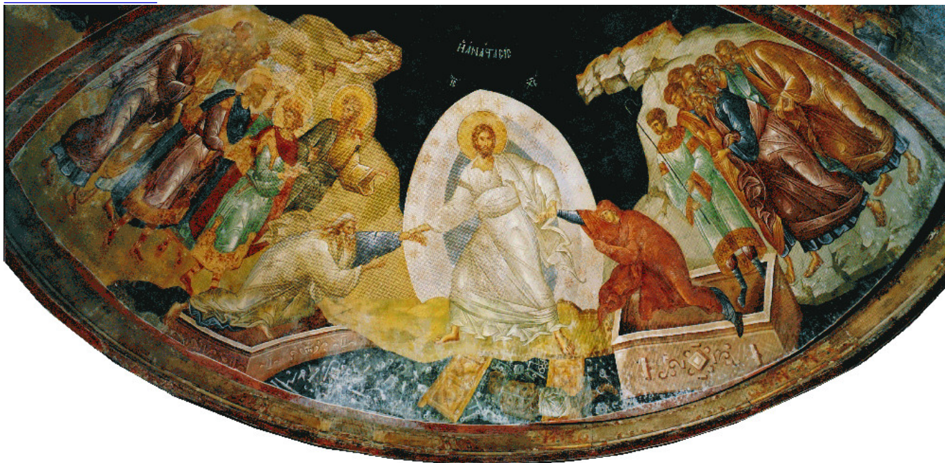
Image of anastasis, or Resurrection, inside of Chora Church Museum, in Istanbul, Turkey (Sarah Sexton Crossan)