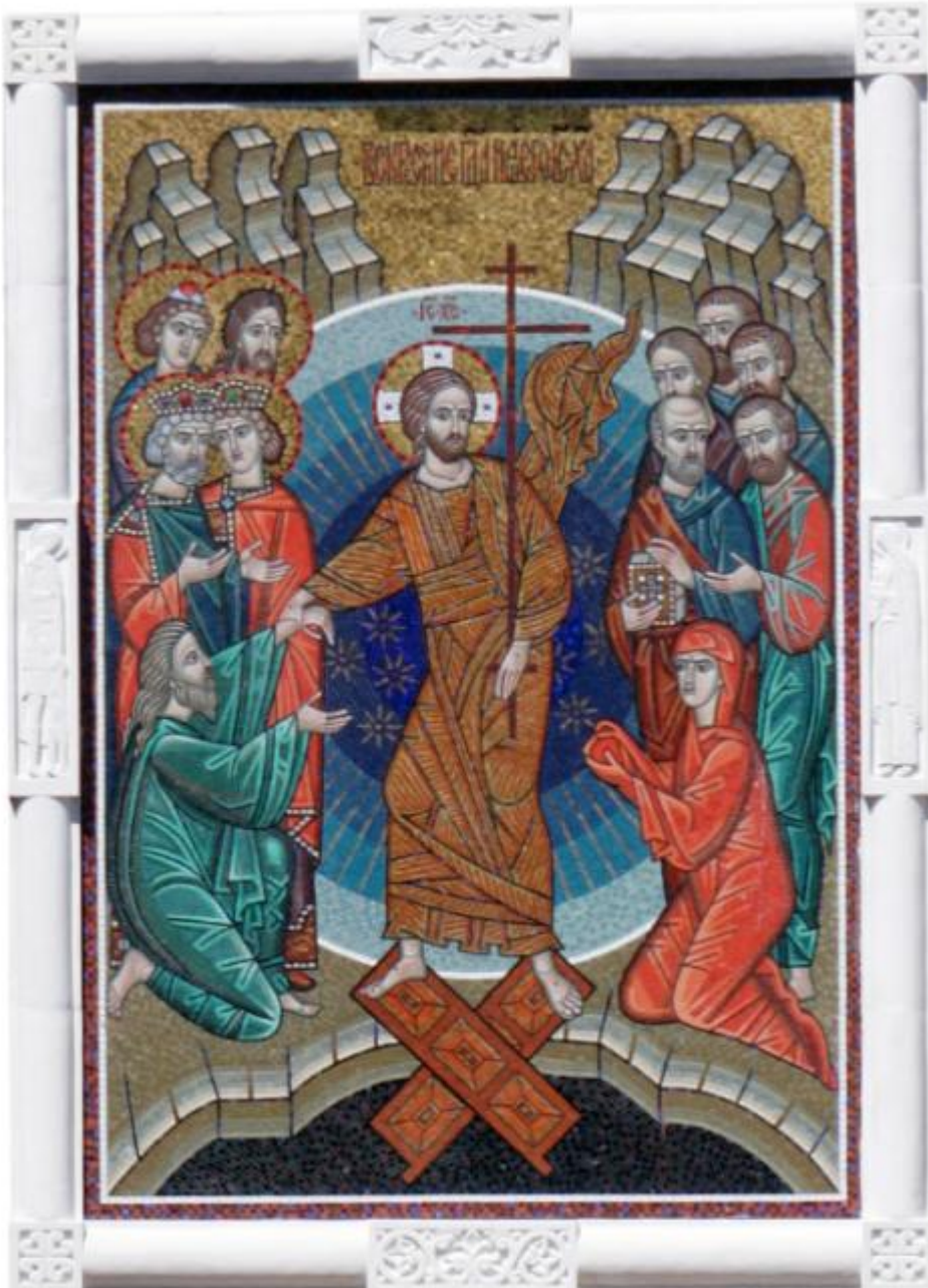
Image of anastasis, or Resurrection, on Resurrection Gate, inside Red Square, in Moscow, Russia (Sarah Sexton Crossan)

was overcome by what it did not see. ... Christ is risen, and the tomb is emptied of the dead.