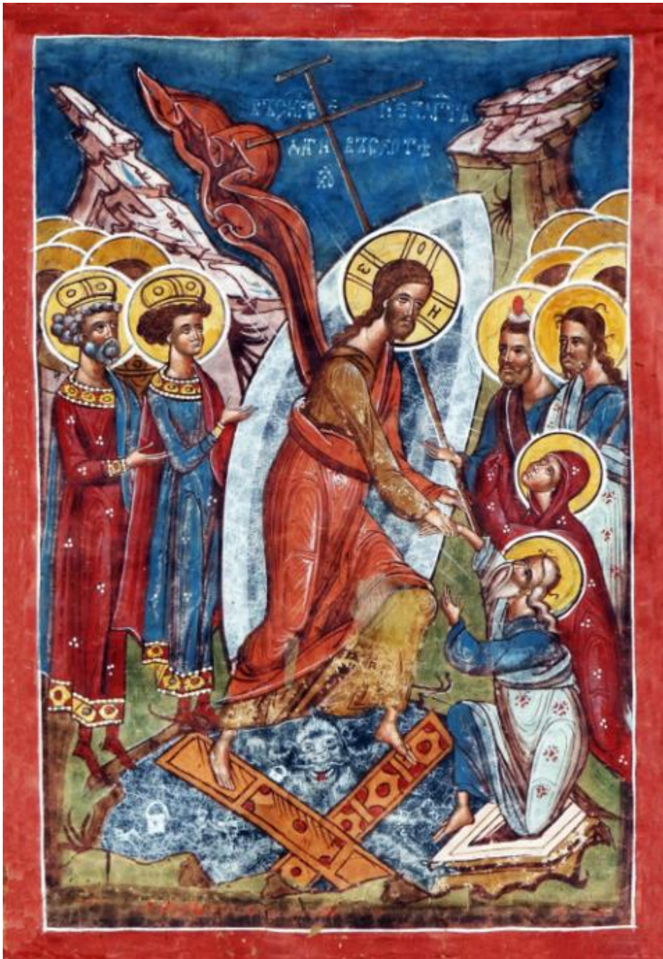
Image of anastasis, or Resurrection, outside of the Church of St. George at the Voronet Monastery in Gura Humorului, Romania

This question set off a quest that ranged along Byzantium's Greek Tiber, the Syriac Tigris, the Russian Neva and the Coptic Nile. The duo made 20 research trips over the course of 15 years to document images and collect information about extant versions of Christ's resurrection, although the authors prefer to use the Greek word anastasis , which literally means "up-rising."