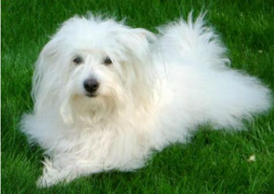
Coton de Tular dog

Somewhere, someplace, some scientist is cloning something. They've cloned cattle, cats, deer, horses, mules, oxen, rabbits and rats. Recently, they've cloned monkeys in China. Can cloning Uncle Fred be far behind?