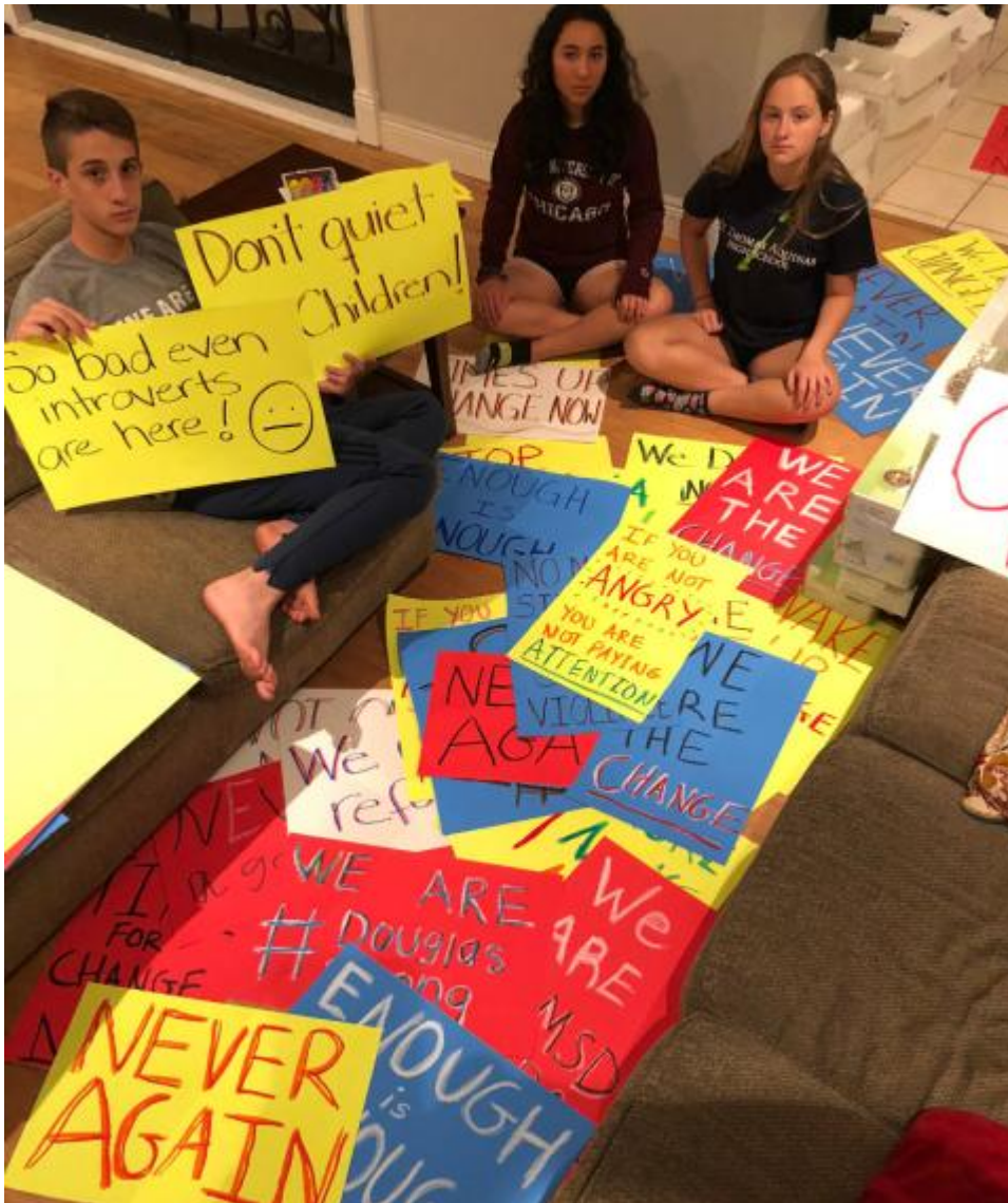
Aquinas students make posters the night before the March for Our Lives in Parkland, Florida.

At the rally that preceded the march, students and parents spoke about their own experiences since the shooting in their community, and called those in attendance to take action to bring about change in the government. One proposed idea asked parents, grandparents and even people without children to sign a contract pledging to vote on behalf of children for candidates who will protect children in schools.