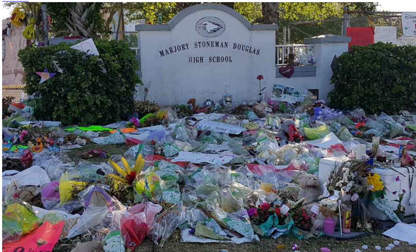
Memorial outside Marjory Stoneman Douglas High School, March 9, in Parkland, Florida