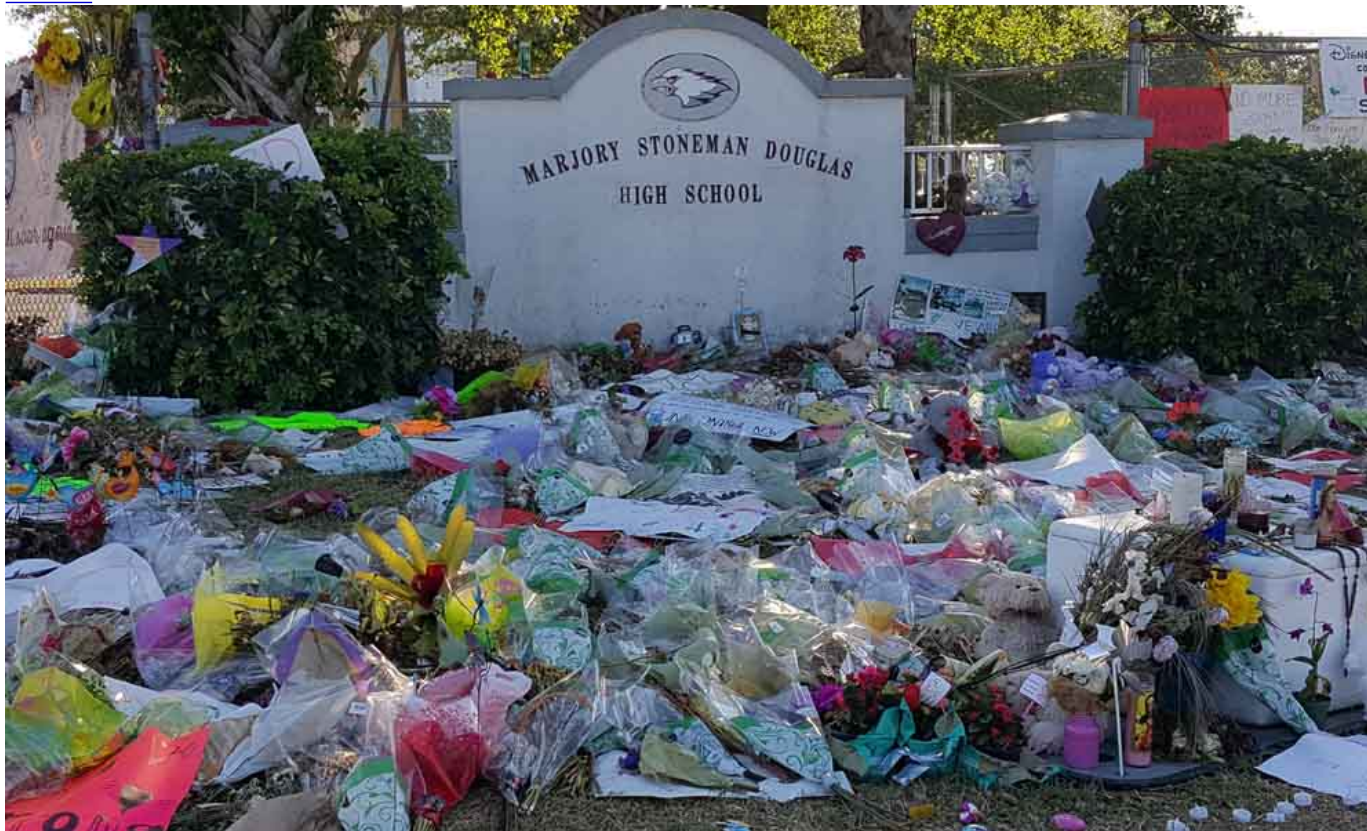
Memorial outside Marjory Stoneman Douglas High School, March 9, in Parkland, Florida