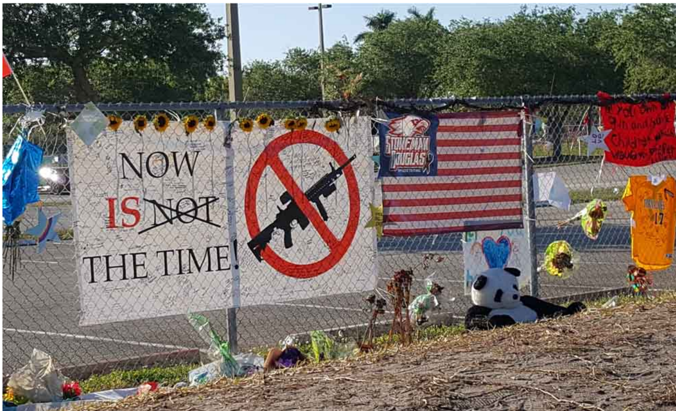
Memorial outside Marjory Stoneman Douglas High School, March 9, in Parkland, Florida