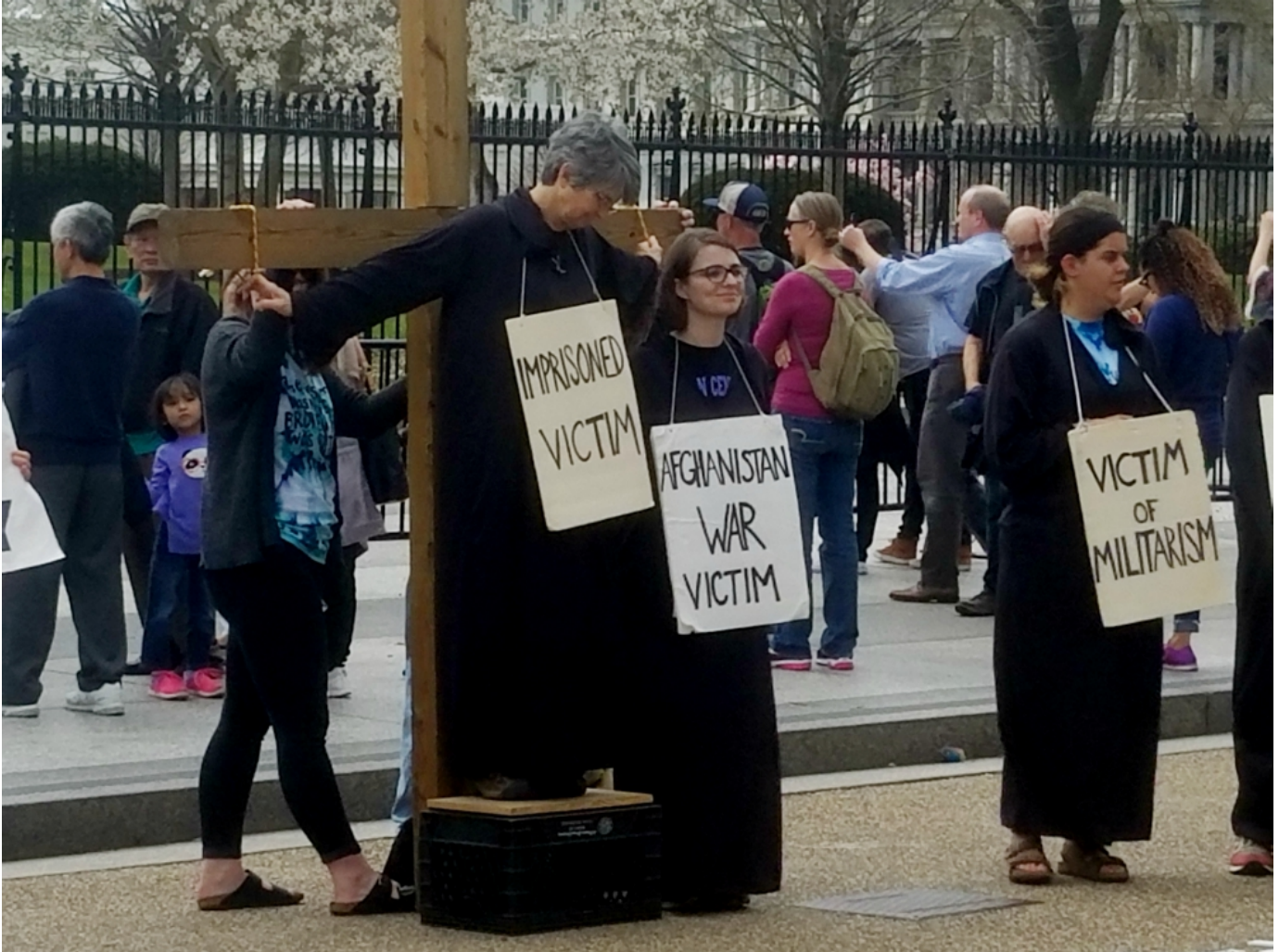
Faith and Resistance retreatants participate in a Good Friday public witness in front of the White House in Washington, D.C., March 30 to protest "contemporary crucifixion."