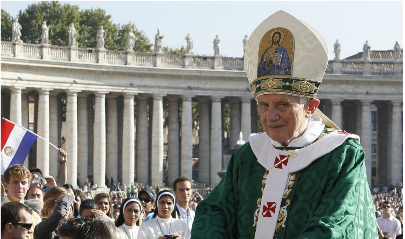
Pope Benedict XVI arrives to celebrate a Mass opening the Year of Faith in St. Peter's Square at the Vatican, Oct. 11, 2012.