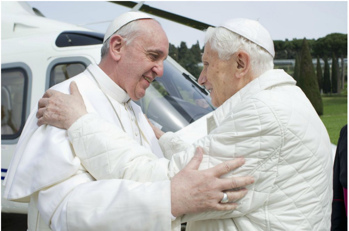
Pope Francis embraces emeritus Pope Benedict XVI at the papal summer residence in Castel Gandolfo, Italy, March 23, 2013. Pope Francis traveled by helicopter from the Vatican to Castel Gandolfo for a private meeting with the retired pontiff.

"The generosity, intelligence and integrity of Pope Benedict were crowned by his last papal act of courage and humility," she said. "His resignation."