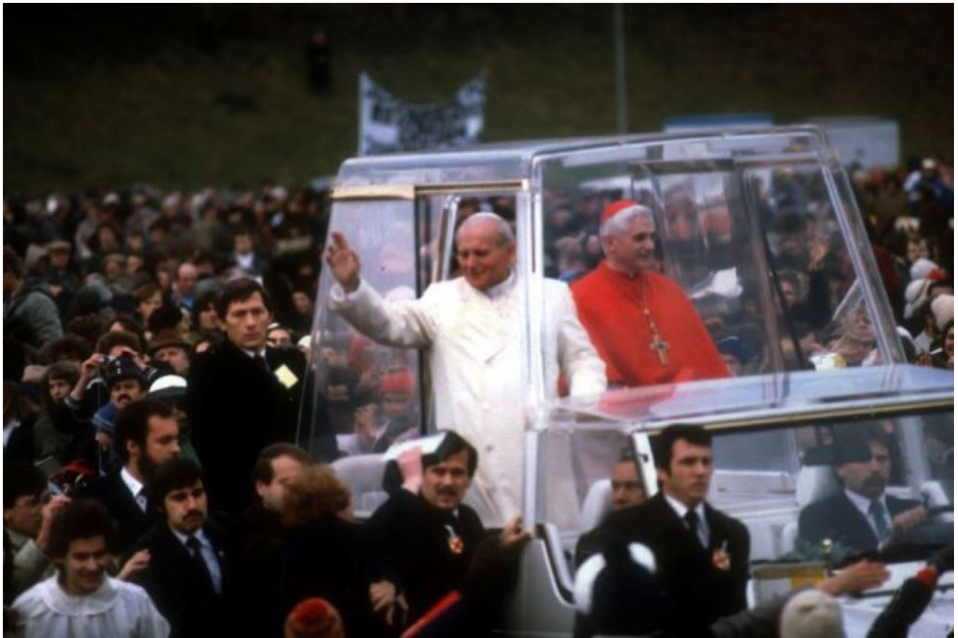
St. John Paul II and Cardinal Joseph Ratzinger ride in the popemobile during a visit to Germany in 1980.

Cardinal Wuerl expressed similar sentiments. While Francis is "getting people's attention" in talking about social issues, he said, "Benedict was already addressing them."