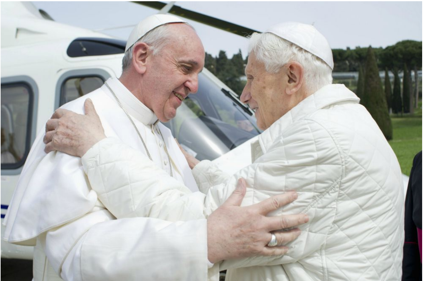
Pope Francis embraces emeritus Pope Benedict XVI at the papal summer residence in Castel Gandolfo, Italy, March 23, 2013. Pope Francis traveled by helicopter from the Vatican to Castel Gandolfo for a private meeting with the retired pontiff.

"The generosity, intelligence and integrity of Pope Benedict were crowned by his last papal act of courage and humility," she said. "His resignation."