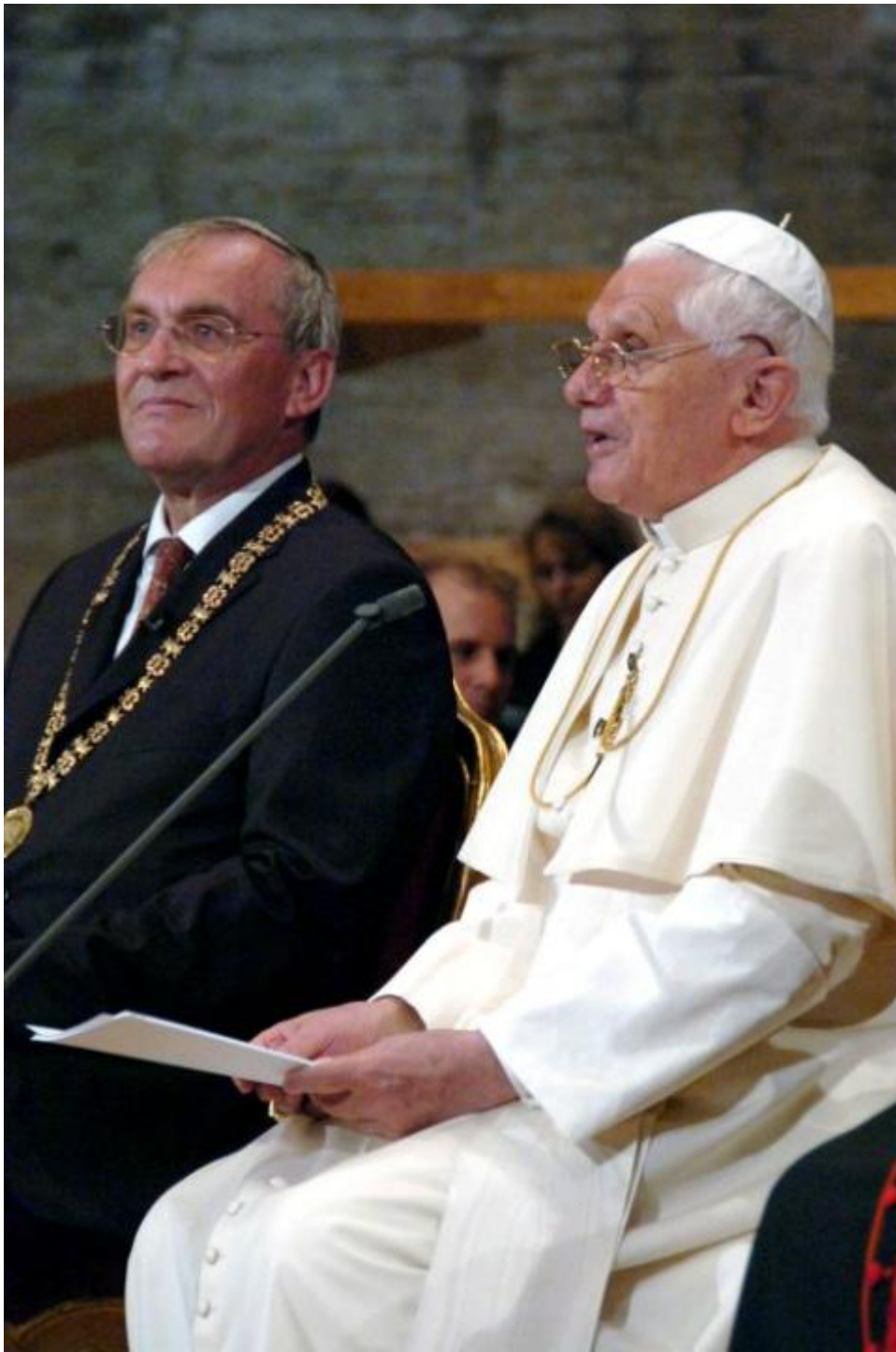
Pope Benedict XVI lectures on faith and reason at the University of Regensburg in Germany Sept. 12, 2006. A quotation from a Byzantine emperor that the pope used in this talk provoked outrage in the Muslim world, but the incident later led to increased dialogue with Muslims.