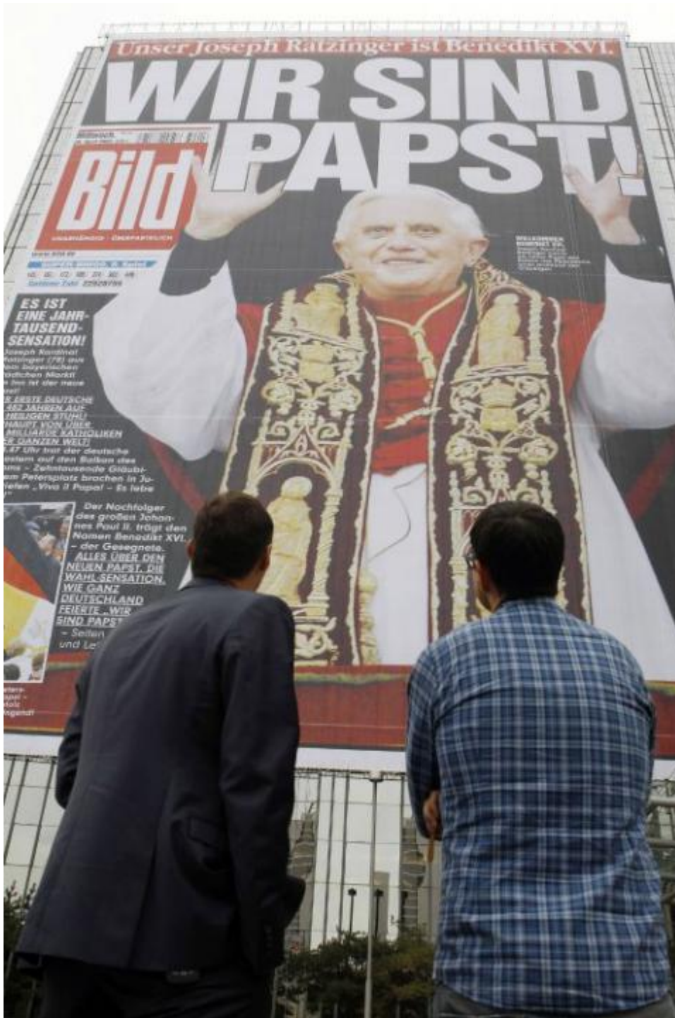
Men look at a giant blow-up of a front page of the German Bild newspaper from April 5, 2005, in Berlin Sept. 19, 2005. The paper features a front-page story about the election of German Cardinal Joseph Ratzinger to be Pope Benedict XVI and reads "We Are Pope."