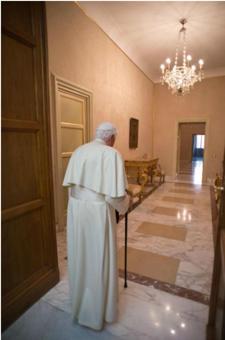
Pope Benedict XVI retires to the apartment at his summer residence in Castel Gandolfo, Italy, Feb. 28, 2013, after appearing at the balcony of the residence. It was his final public appearance on the balcony before his papacy drew to a close.