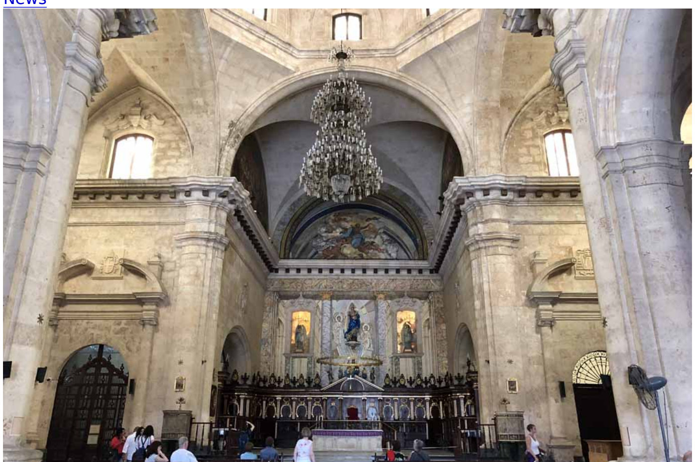
Havana Cathedral, in Havana, Cuba