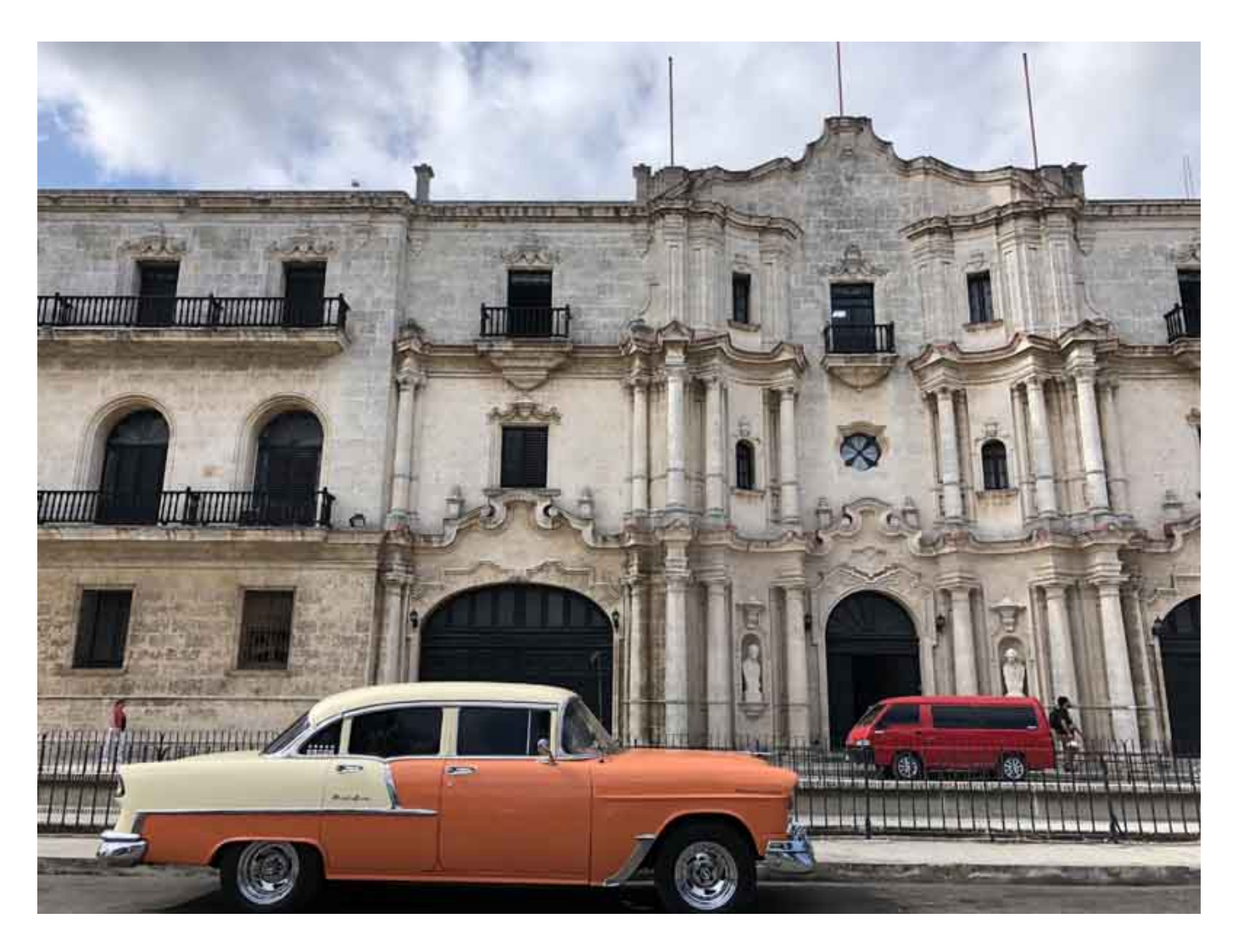
The Felix Valera Cultural Center in Havana