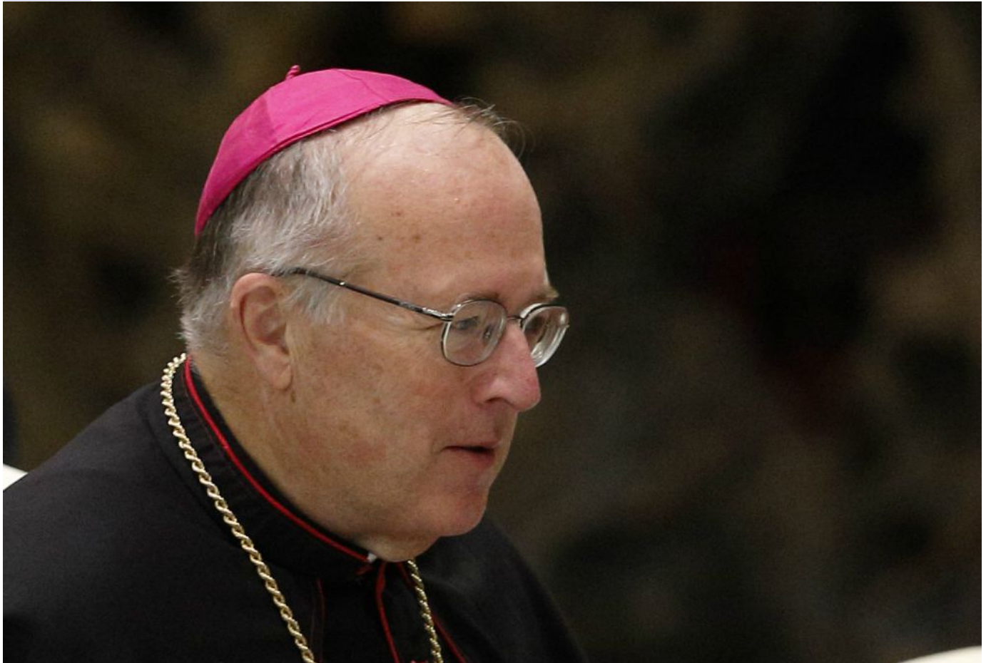
San Diego Bishop Robert McElroy pictured November 2016