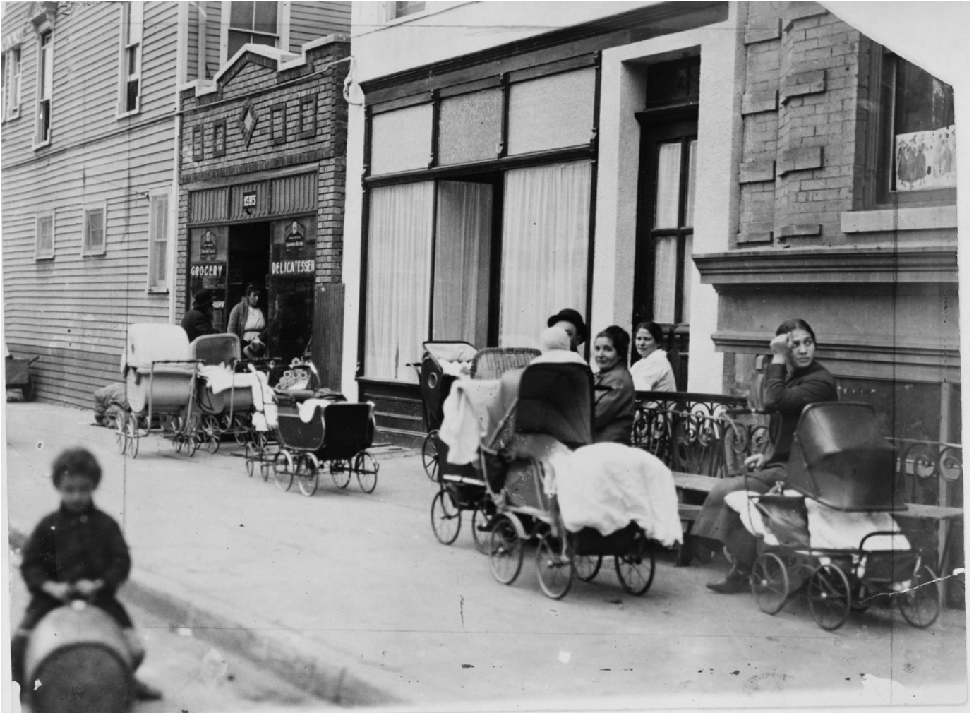
Women and men sit with baby carriages in front of the Sanger Clinic in New York City in October 1916.