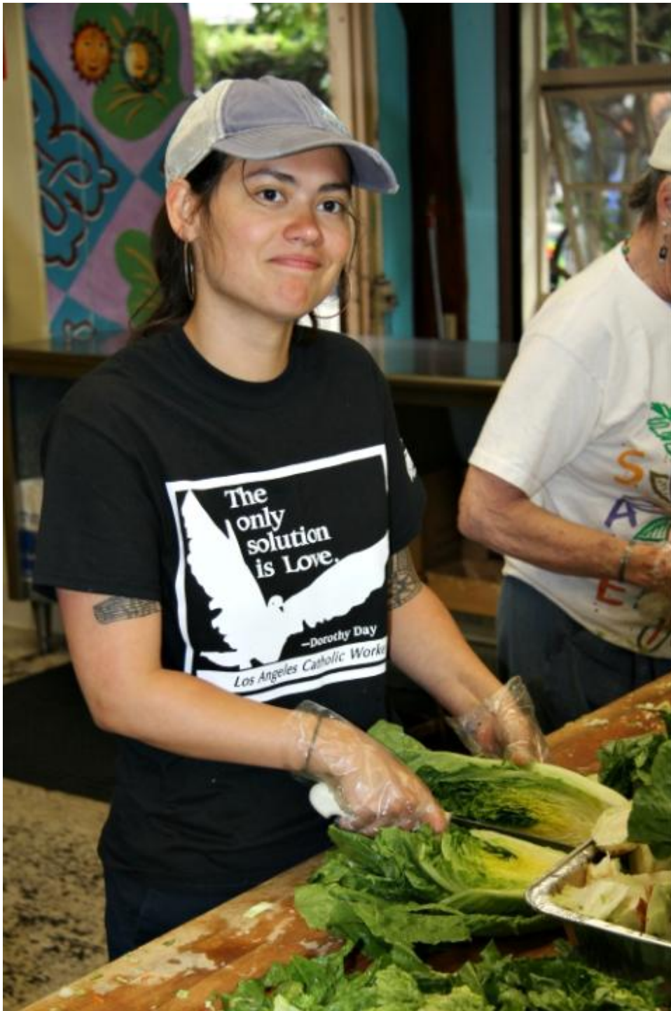
Food preparation at the Los Angeles Catholic Worker

However, even these communities don't make Catholicism a requirement for those who might like to join, and the movement resonates with non-Catholics as well.