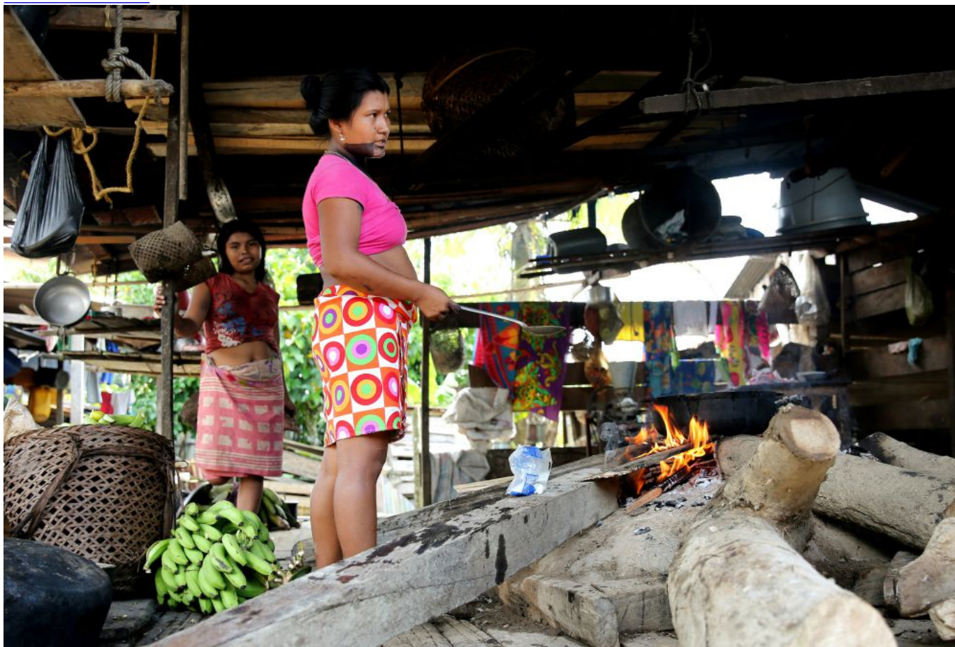
An indigenous Embera woman cooks food in Quibdo, Colombia, March 2017.