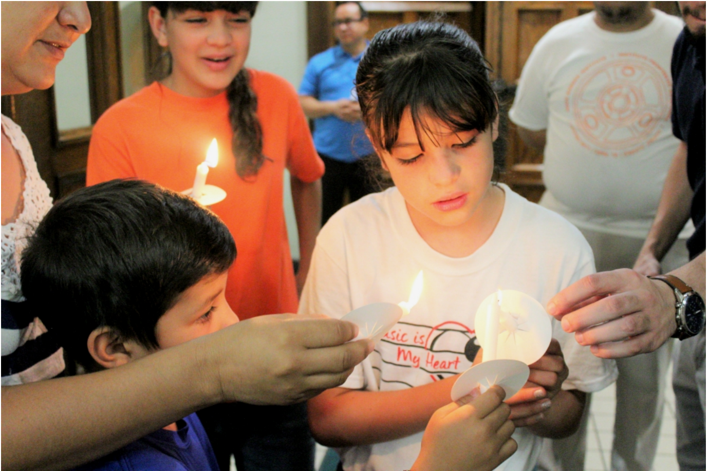
Guided by parents, children light candles during the July 20 service at St. Patrick Cathedral in El Paso, Texas.

Many of the July 21 teach-in attendees already accompany migrants in some capacity. Some volunteer at temporary shelters, visit the detained or are involved in a parish ministry. Yet they need support in doing what is viewed as "countercultural."