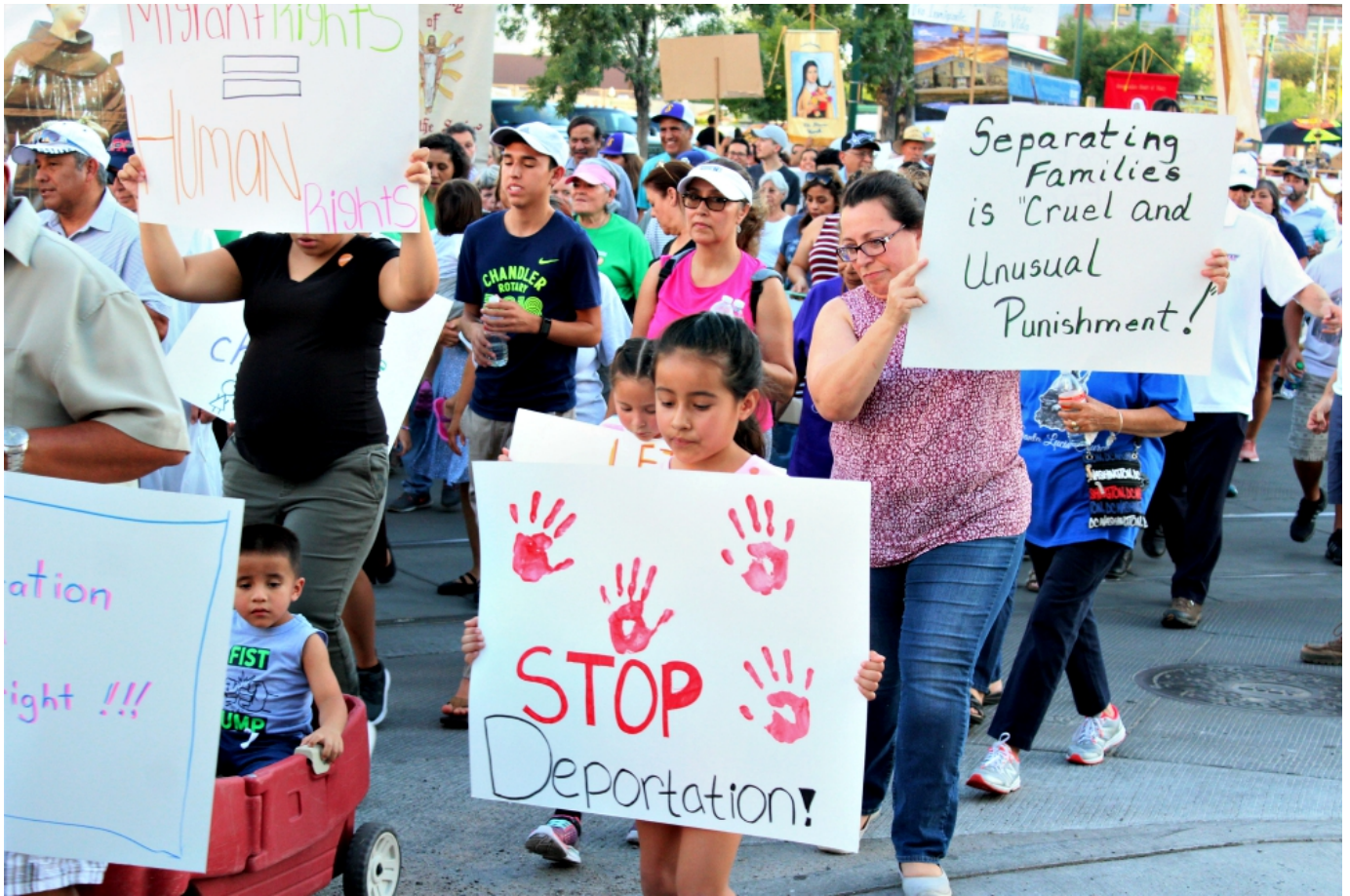
Families of El Paso, Texas, and surrounding areas walk in heat over 100 degrees on July 20 to express support for migrant families.

[Pauline Hovey is a writer living in El Paso where she accompanies migrants and refugees at a hospitality center.]