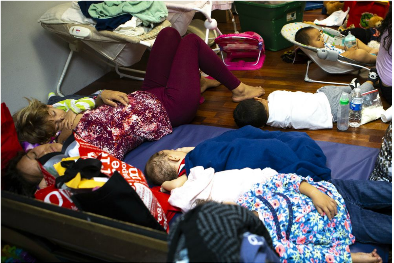
Exhausted immigrants, recently released from U.S. custody, sleep on the floor of a Catholic Charities-run respite center in McAllen, Texas, July 1.

Before the rule can go into effect, it is subject to a 60-day comment period to allow input from members of the public. The comment period is followed by 45-day delay to give administration officials the chance to review the comments and consider making changes.