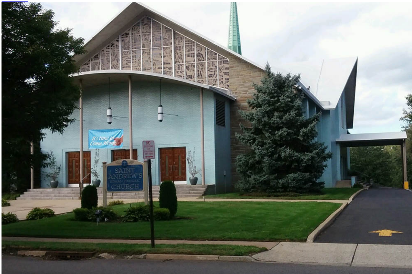
St. Andrew's Church in Westwood, New Jersey