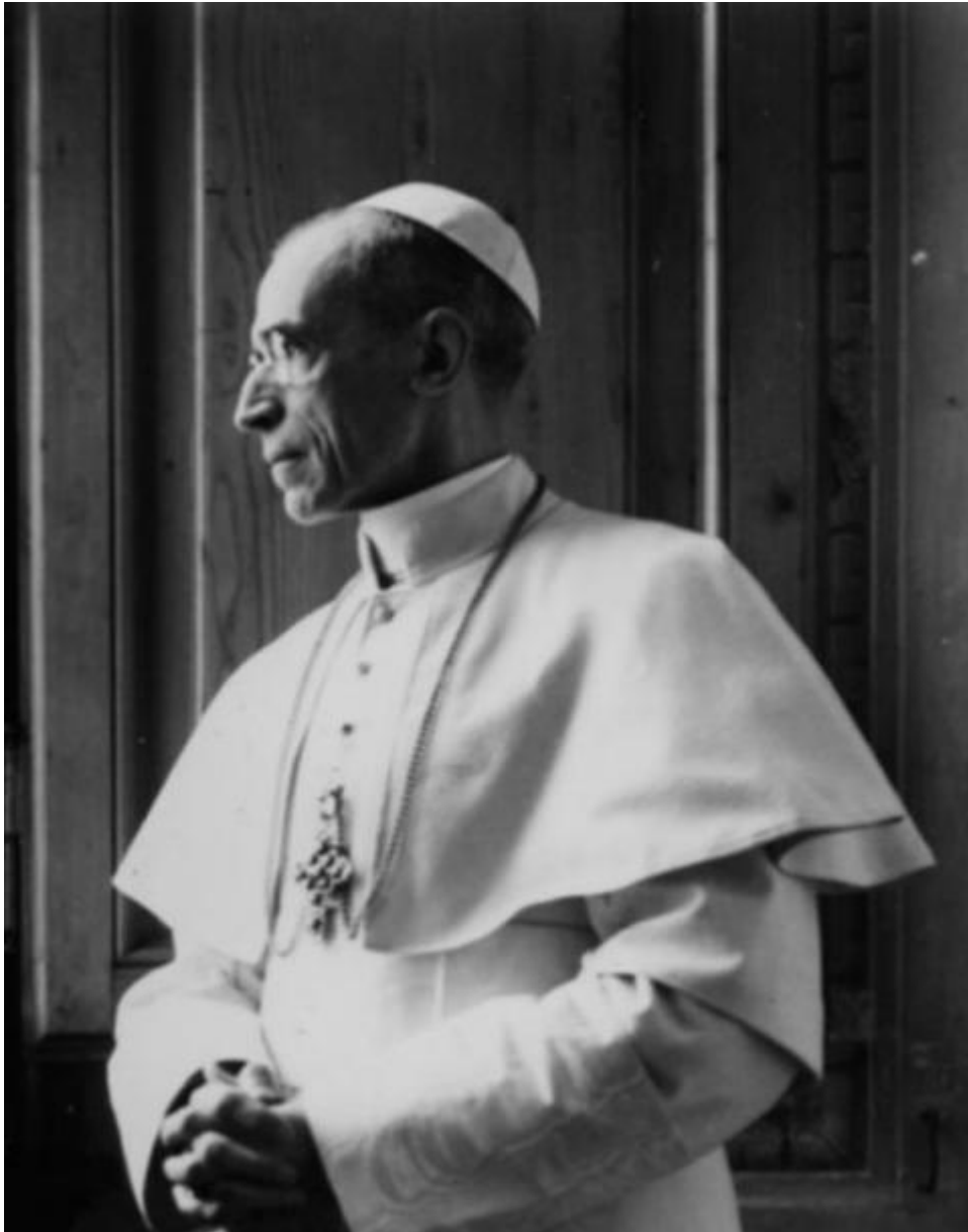
Pope Pius XII is pictured at the Vatican in a file photo dated March 15, 1949.

The Church-in-Rome's managerial closed shop, limited to selected male clerics, was at the root of the pedophilia crisis. Not for what it permitted, but for what the Church-in-Rome (pope, College of Cardinals, Curia and senior archbishops and bishops), i.e., the church bureaucracy, fostered: an exclusive Old Boys Club based on a rigid class system.