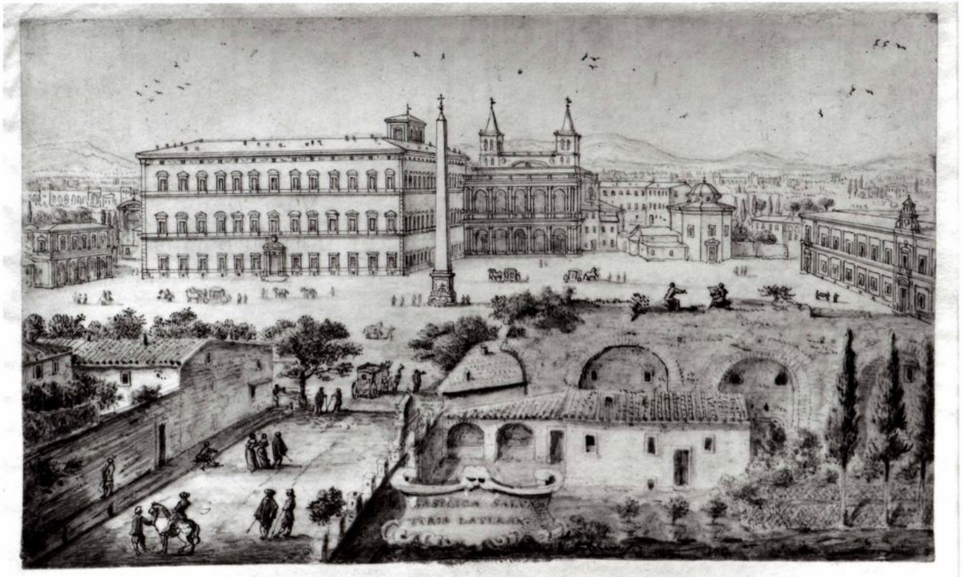
"View of Lateran, Rome," by Lievin Cruyl, 1672-73 (Metropolitan Museum of Art)

Christianity used the internet of the day — word-of-mouth. For much of the time in the early decades, and in many places, no one but other Christians quite knew for sure who was Christian and who was not.