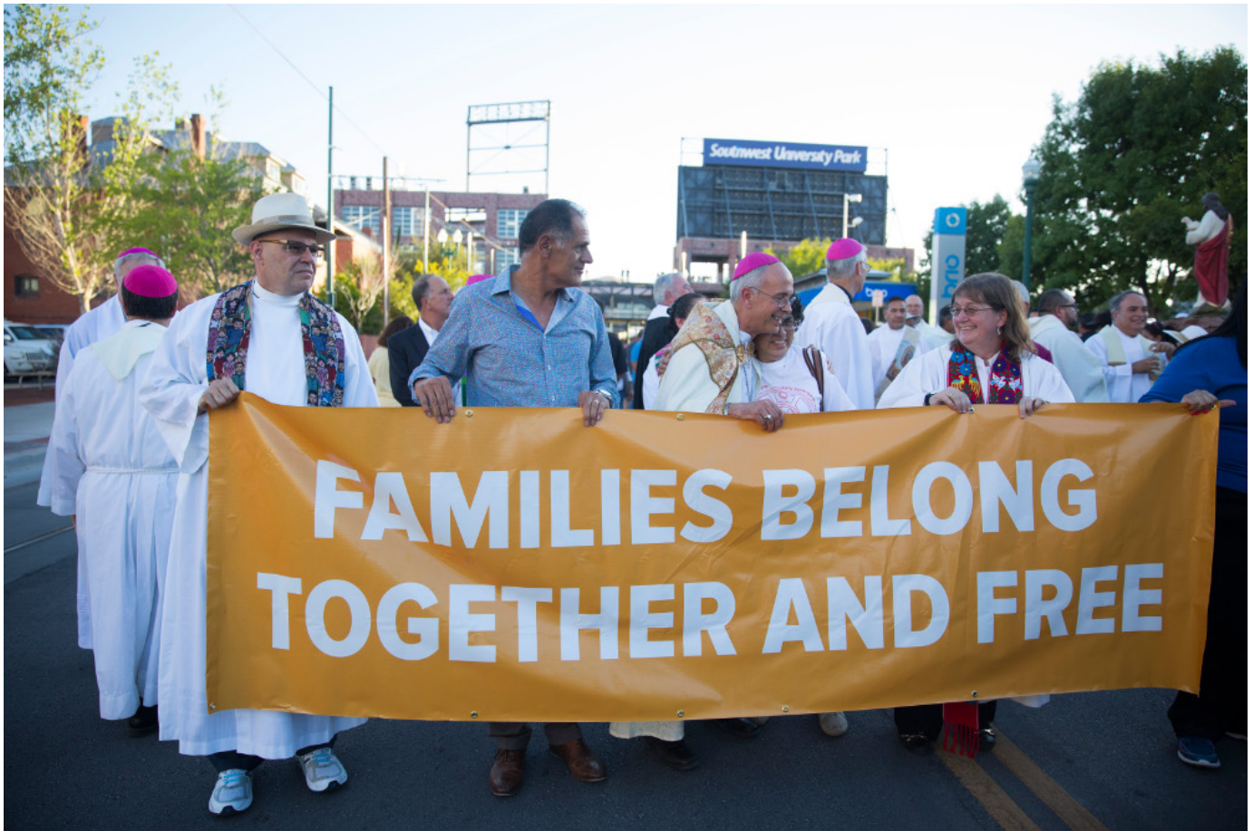
Bishop Mark Seitz of El Paso, Texas, embraces a woman during a march for immigration rights July 20 in El Paso.

Many Hispanics may actually be "more in tune with the Republican Party" in many ways but are currently alienated by harsh anti-immigrant rhetoric, he added. "If the Republican Party were to ever develop a strong immigration position I think the Democrats would find themselves incredibly threatened trying to keep the Hispanic vote."