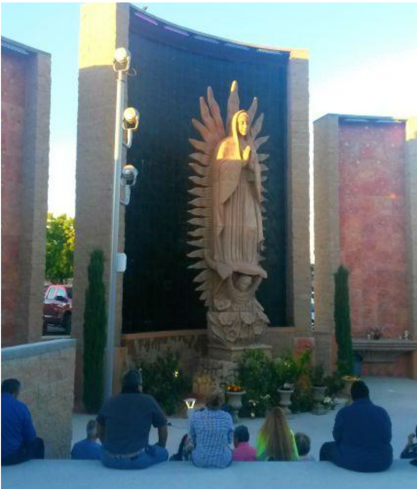
People say the rosary near a fountain representing the Virgin Mary at St. Mark Catholic Church in El Paso, Texas, Sept. 17.