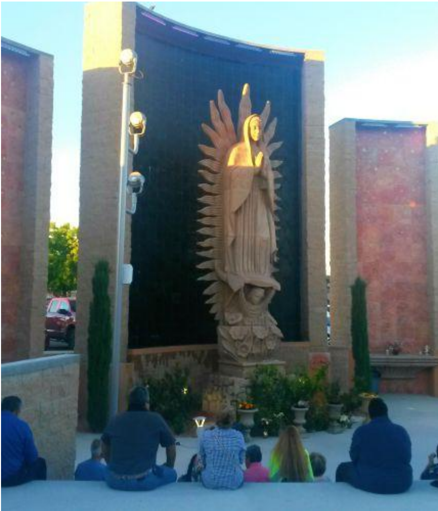
People say the rosary near a fountain representing the Virgin Mary at St. Mark Catholic Church in El Paso, Texas, Sept. 17.