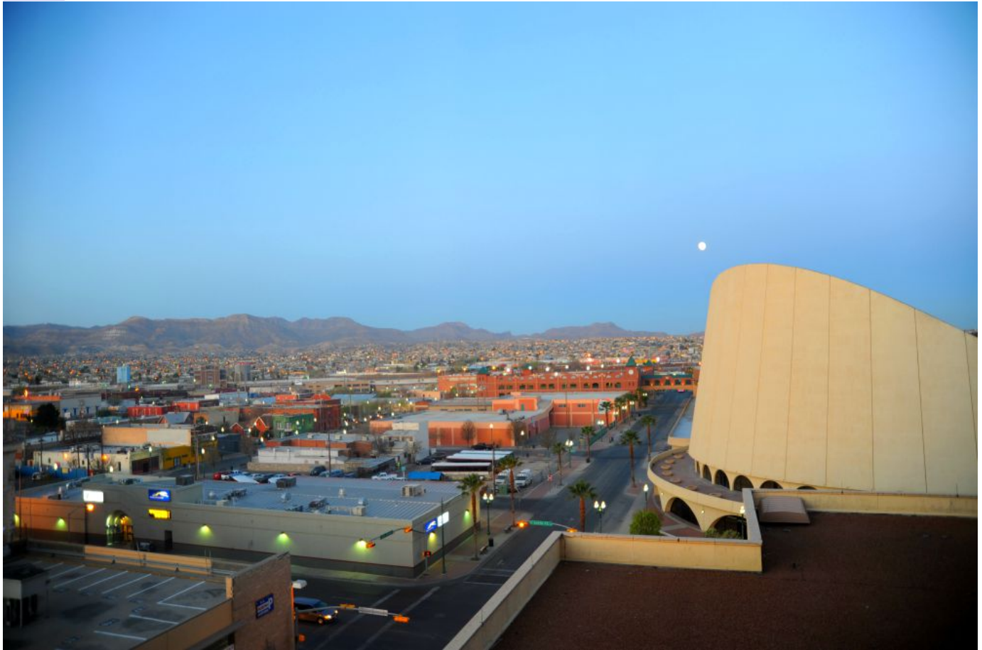
San Antonio Ave, El Paso, Texas, 2009, showing the Abraham Chavez Theater