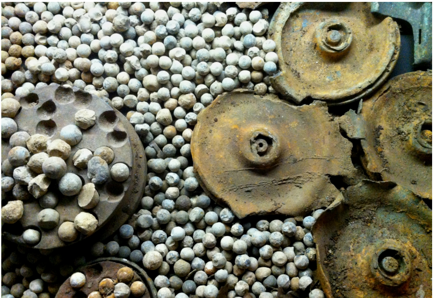
Shrapnel from World War I is displayed at In Flanders Fields Museum in Ypres, Belgium.

Middle and high school students are not too young to examine the rise of technology during warfare. German engineering excelled in machine gun and anti-aircraft manufacturing, while Britain was quick to create an all-metal fighter aircraft and a heavy bomber. Both the Allies and the Central Powers used mines, gas, shrapnel, torpedoes, machine guns, heavy artillery and grenades to finish off one another.