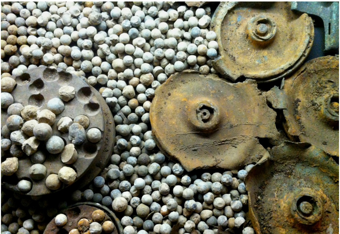
Shrapnel from World War I is displayed at In Flanders Fields Museum in Ypres, Belgium.

Middle and high school students are not too young to examine the rise of technology during warfare. German engineering excelled in machine gun and anti-aircraft manufacturing, while Britain was quick to create an all-metal fighter aircraft and a heavy bomber. Both the Allies and the Central Powers used mines, gas, shrapnel, torpedoes, machine guns, heavy artillery and grenades to finish off one another.