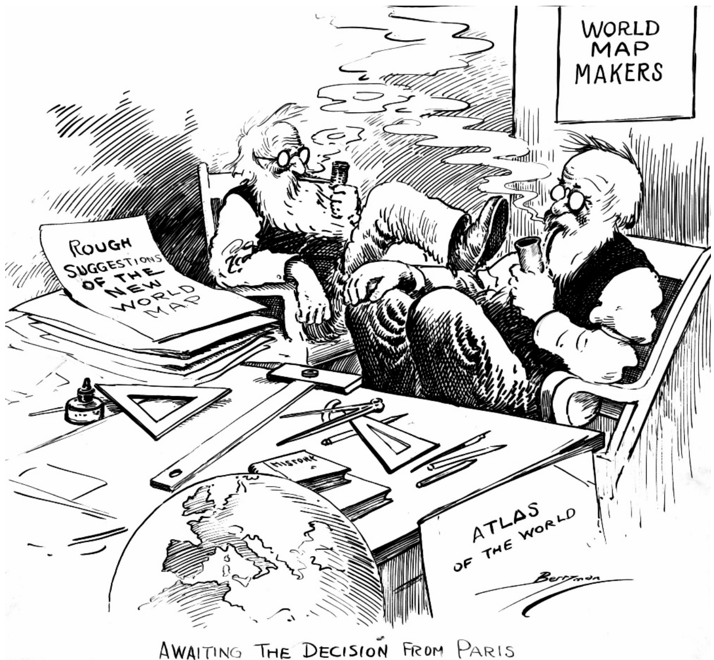
AWAITING THE DECISION FROM PARIS

A January 1919 cartoon by U.S. cartoonist Clifford Berryman comments on the Great War's peace negotiations then ongoing in Paris.