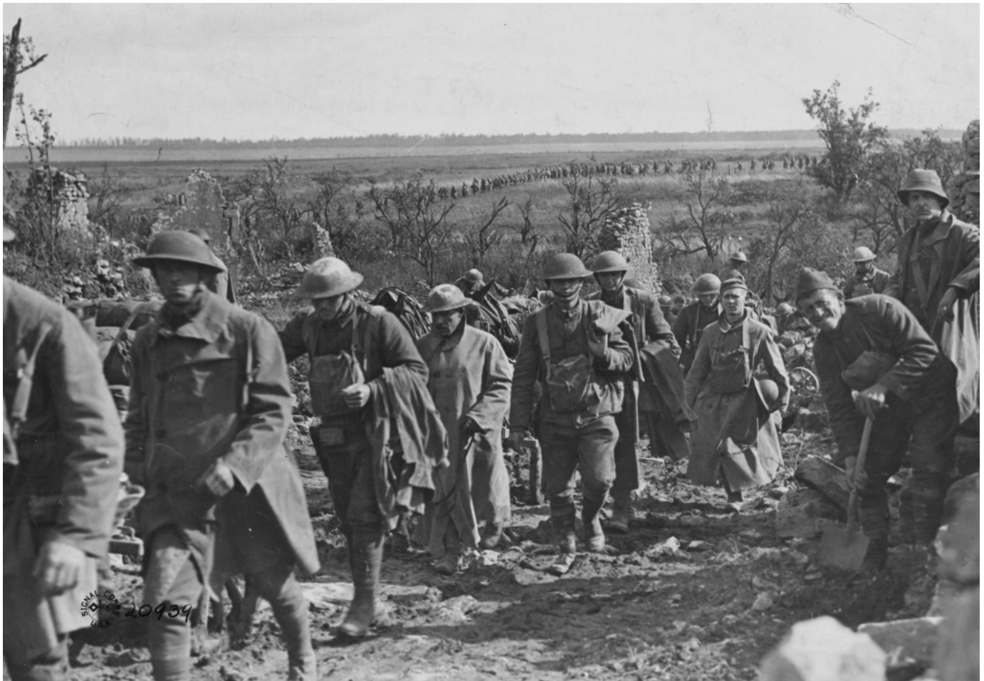
An American machine gun company passes through the ruins of a French village in advance of the Battle of Saint-Mihiel in September 1918.

Nothing is more uplifting than seeing Flanders' fields on a beautiful spring day when floral trees disguise the granite corridors of buried corpses. Men who died within a few meters of one another in a war of attrition that allowed hardly any progress by the advancing army now lie ever so close for another aeon. Nearly 31,000 Americans rest among them in Flanders and in other European graveyards.