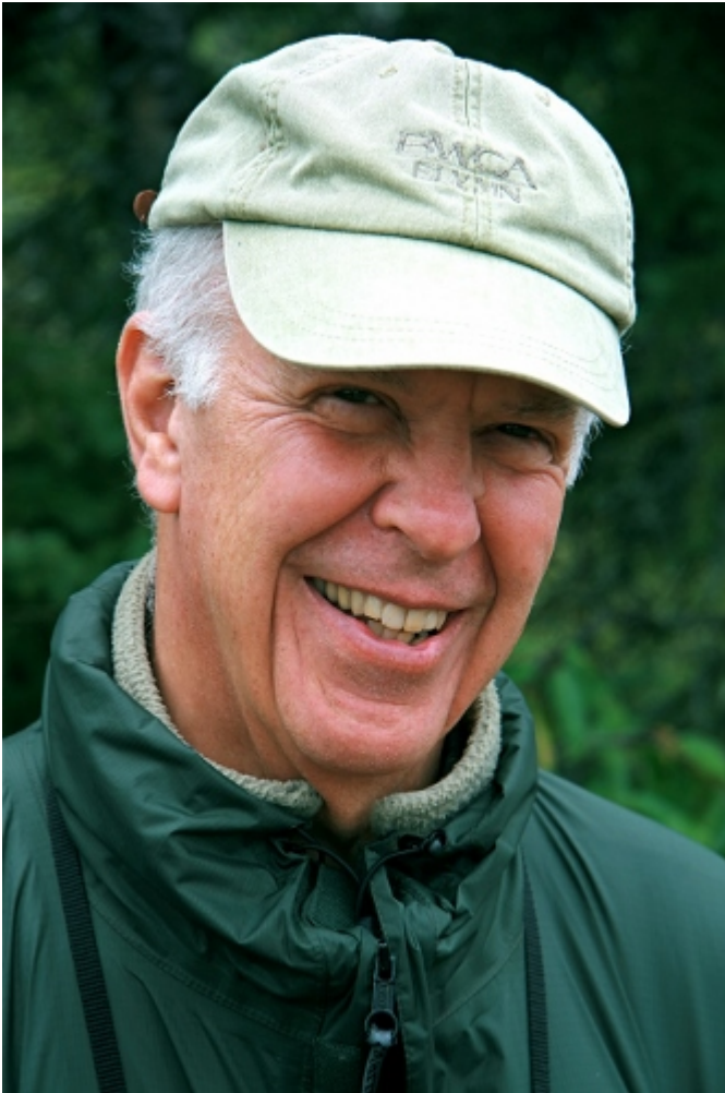
Parker J. Palmer