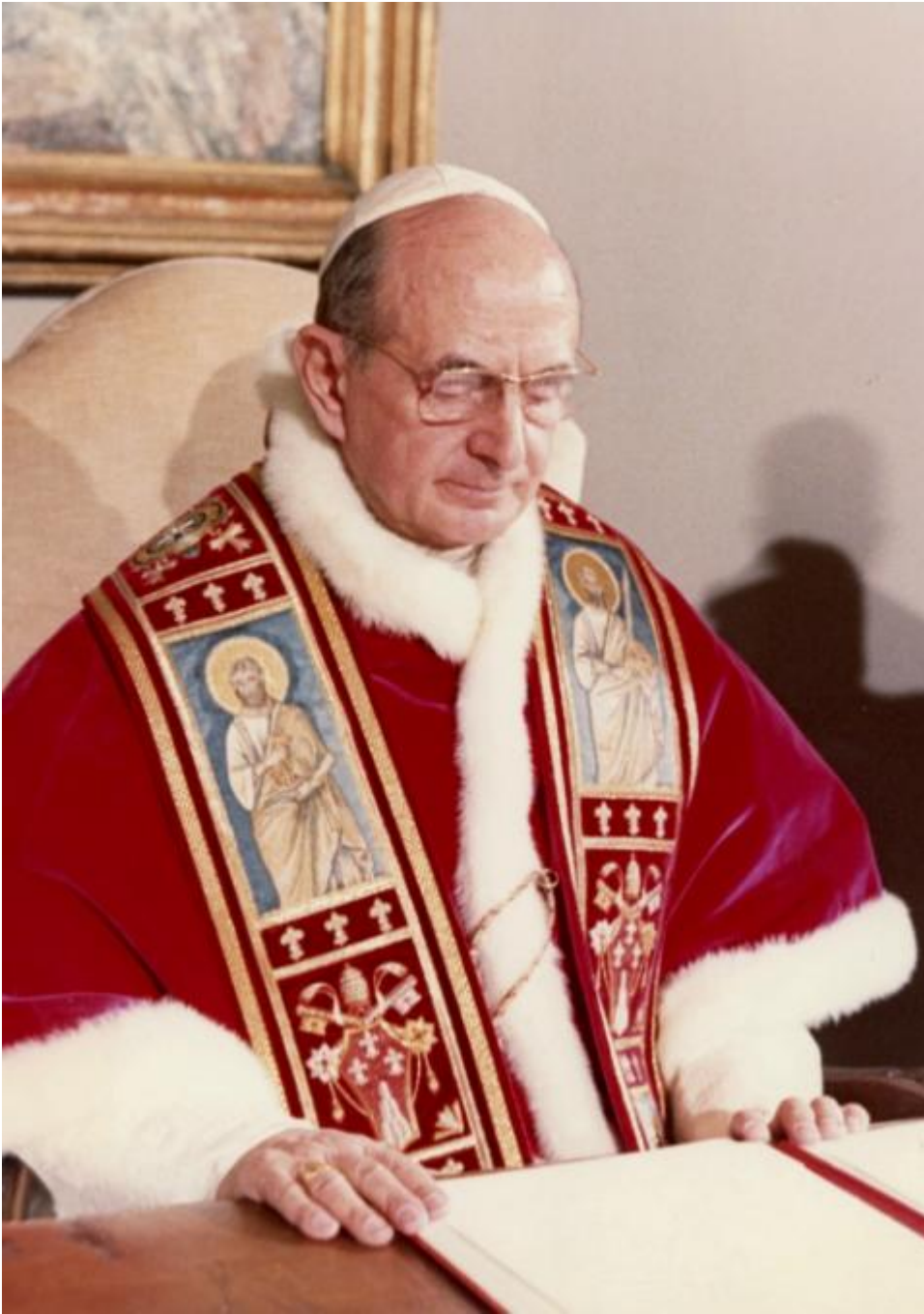
Pope Paul VI at the Vatican on June 29, 1968

"The American Catholic community experienced a very similar, and seemingly equally quick, disappearance of a revered theological system after 1968," Massa writes. "What passed from the scene was, as in the earlier case, a rigorously systematic, even logical, theological system, which has been traditionally labeled 'neo-scholastic natural law.' "