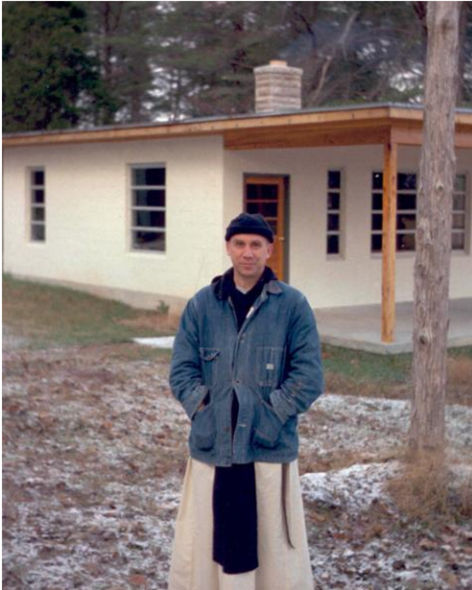
Trappist Fr. Thomas Merton, pictured in an undated photo

Third, there is what I believe is the most significant reason why people should care about Merton today: his unabashed humanity. Like his friend and contemporary, Dorothy Day, Merton is one of the few Christian exemplars we have who are not encumbered by hagiography and selective memory. A truly modern person, Merton's story is one with many turns, surprises, challenges and moments of grace. He had a life before the monastery and he had a life in the monastery: both periods lasted about 27 years. Both halves of his life reveal a complex man whose sanctity and sinfulness, pride and humility, ambition and regret are on wide display, thanks to his