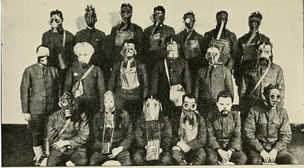
VARIOUS TYPES OF GAS-MASKS USED IN THE WAR

Share on BlueskyShare on FacebookShare on TwitterEmail to a friendPrint