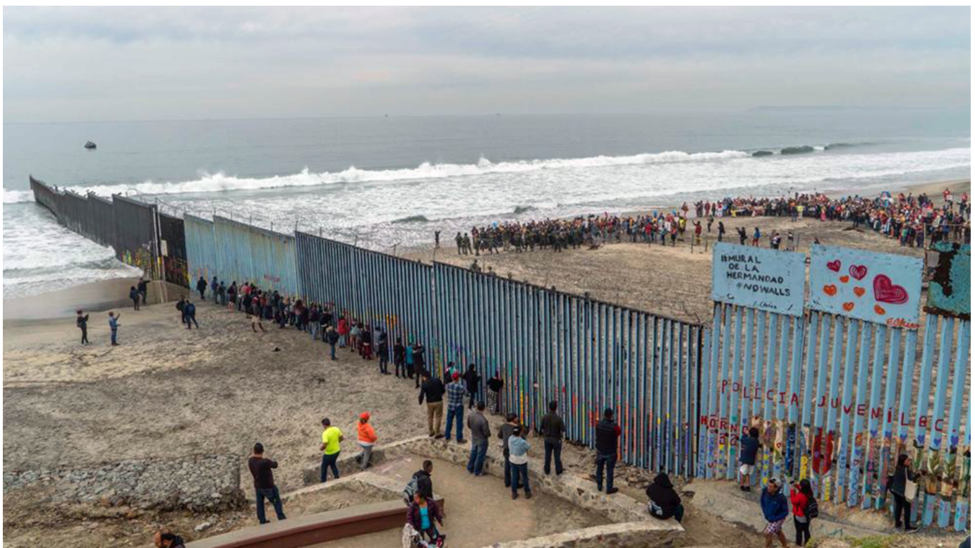
People protest against U.S. immigration policies on the American side, right, of the U.S.-Mexico border in Southern California on Dec. 10, 2018.

"I was there in the role that several of us played: as peacekeeper, to try to keep people moving, to try to keep things focused on why we were there," she said.