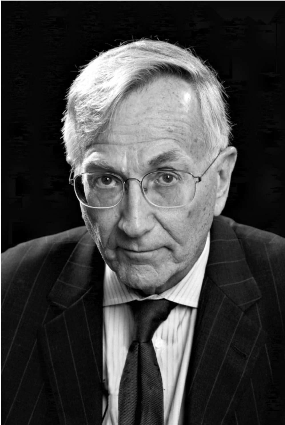
Seymour Hersh