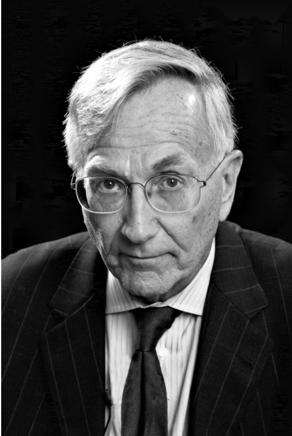
Seymour Hersh