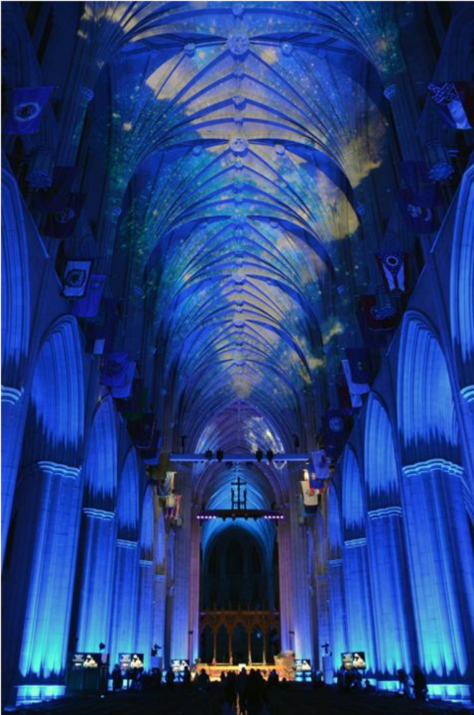
Projectors illuminate the ceiling of the Washington National Cathedral scenes of the cosmos on Dec. 11, 2018.

Fusions of space and faith have also sparked controversy.