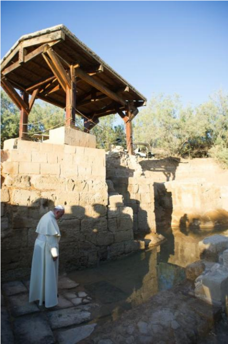
Pope Francis visits Bethany Beyond the Jordan, the traditional site of Jesus' baptism, southwest of Amman, Jordan, May 24, 2014.

The Franciscan chapel, a squat, round building with curving staircases, was built in the 1920s during the British Mandate, on the Israeli side of the river. The white stones of the building melt into the reds and tans of the arid Jordan valley, just a few