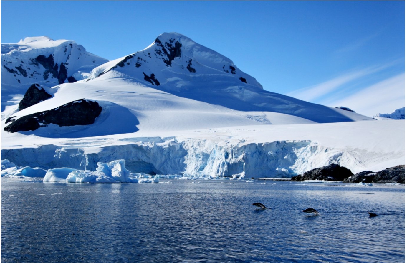
Paradise Harbor, Antarctica