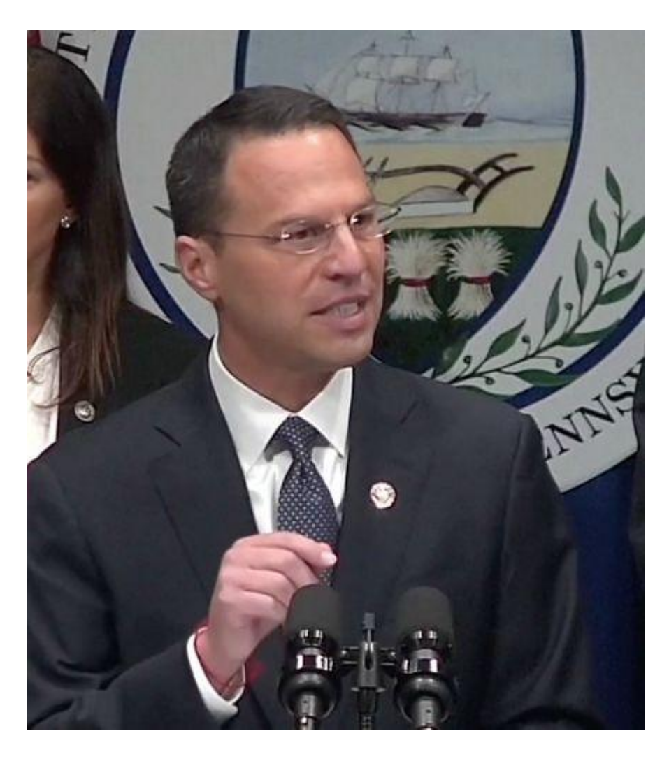
Pennsylvania Attorney General Josh Shapiro speaks during an Aug. 14, 2018, news conference