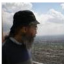
by Gabe Huck