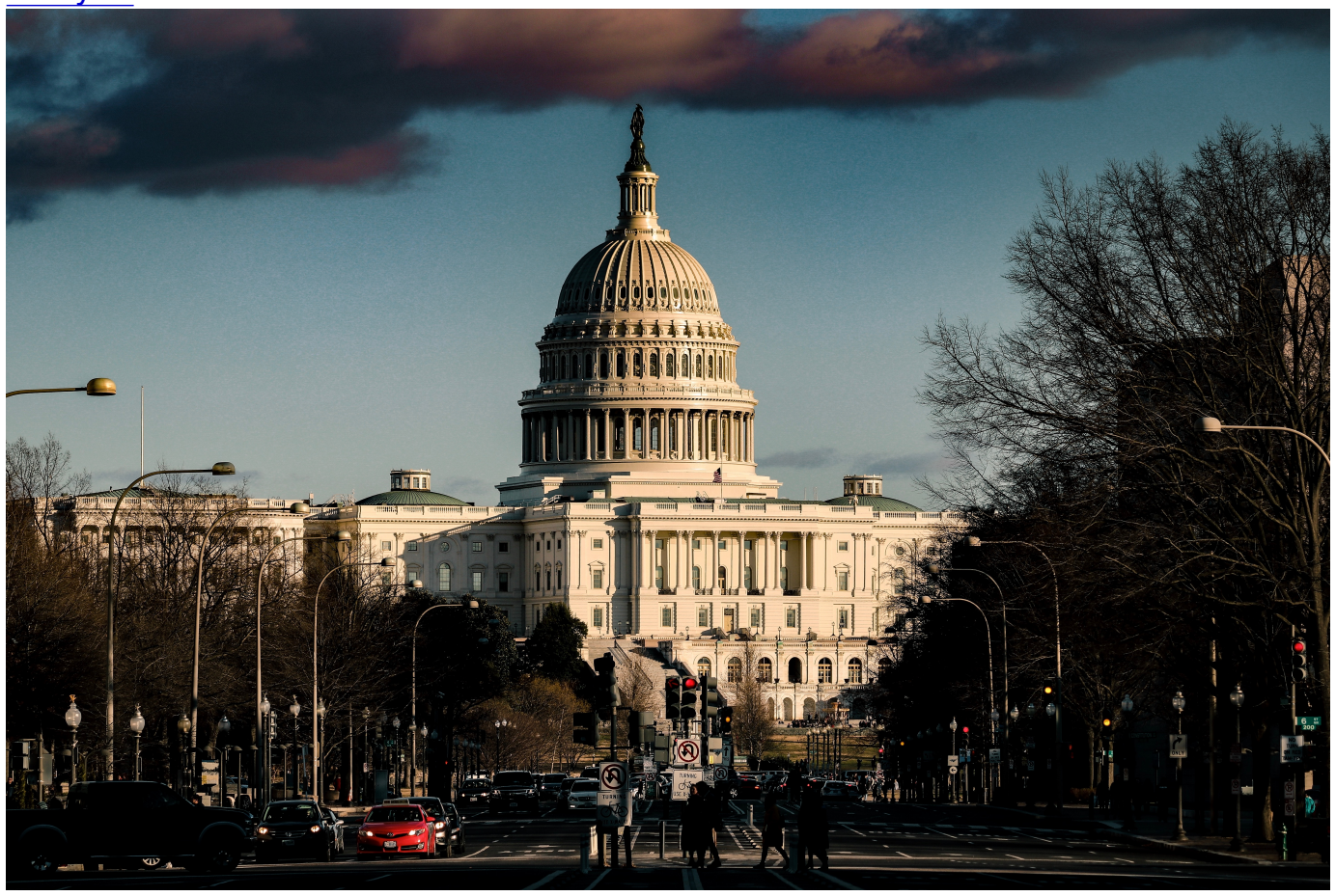
The United States Capitol in Washington, D.C.