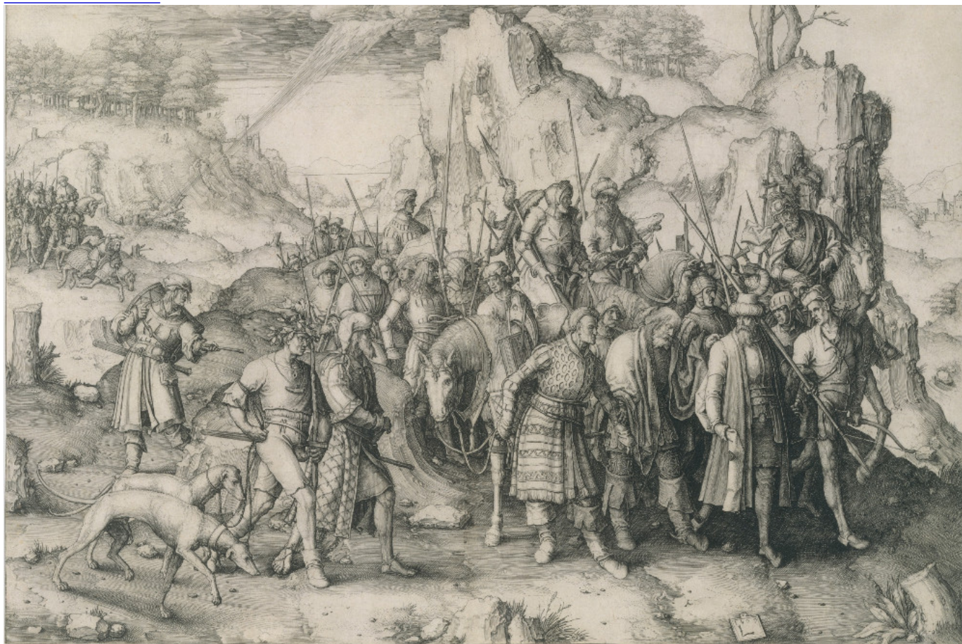
"The Conversion of St. Paul," engraving by Lucas van Leyden, 1509

Opinion Spirituality Culture Book Reviews