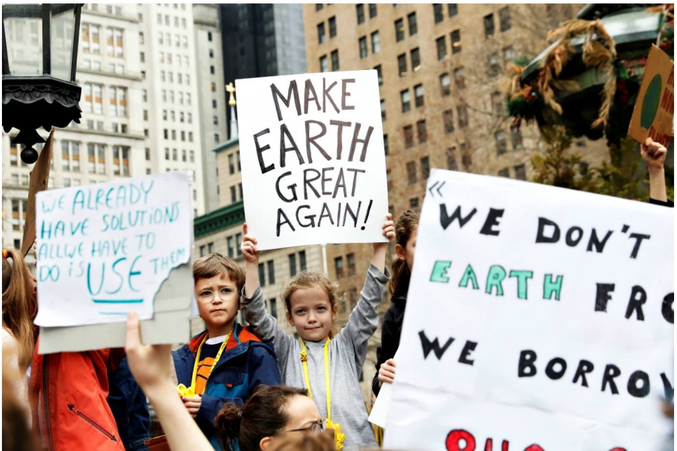
Students hold signs in New York City March 15 to demand action on climate change. Students from around the world participated in the "strike."

President Donald Trump has stated he will withdraw the United States from the Paris Agreement at the earliest date â?? Nov. 4, 2020, a day after the next presidential election â?? which would place the greatest contributor to historical carbon emissions out of step with the rest of the world. The rise in nationalist sentiments has led other countries, like Brazil, to question their commitments to reducing emissions while doubling down on drilling, mining and logging.