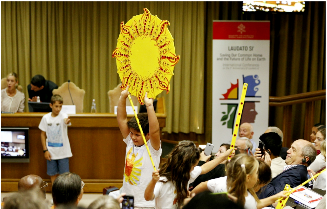
A boy holds up artwork of the sun as children perform at the start of an international conference marking the third anniversary of Pope Francis' encyclical "Laudato Si", on