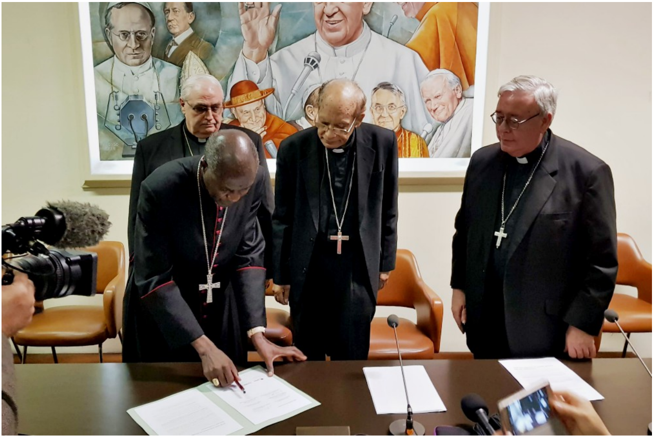
Cardinals and archbishops sign a joint statement at the Vatican Oct. 26, 2018, calling on the international community to take action against climate change.