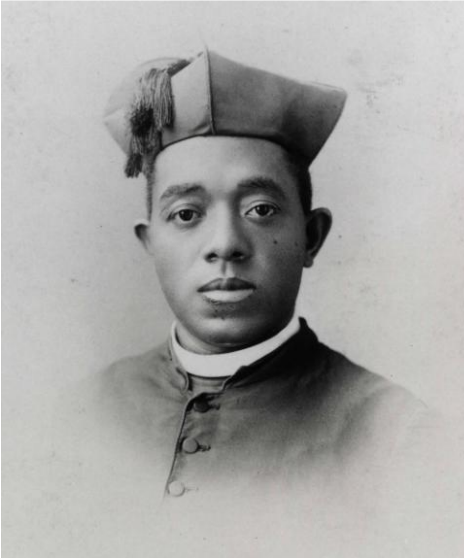
Fr. Augustus Tolton