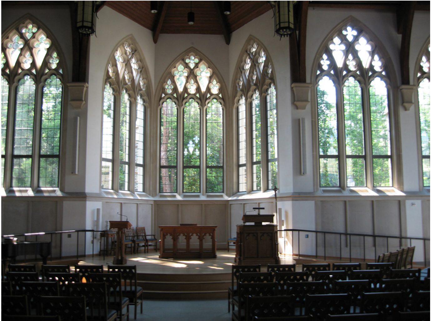
The interior of Goodson Chapel at the Duke Divinity School