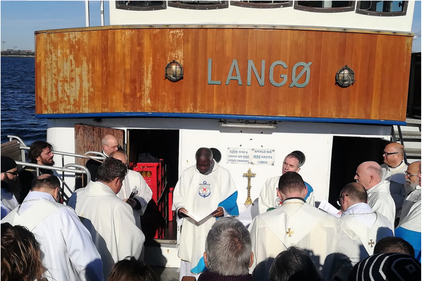
Cardinal Peter Turkson, prefect of the Dicastery for Promoting Integral Human Development, celebrates Mass onboard a ship in Copenhagen May 5 during a Vatican-sponsored conference titled "The Common Good on Our Common Seas."