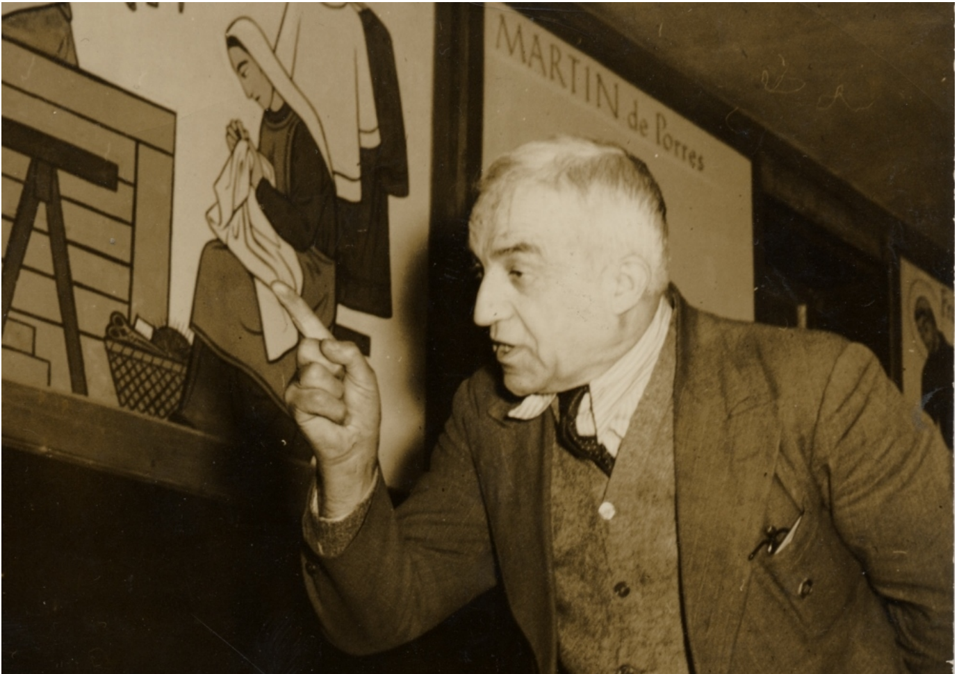
Peter Maurin in the 1930s

While he outlined a three-point program of action — roundtable discussions for "the clarification of thought," houses of hospitality where the works of mercy could be practiced, and founding farming communes or "agronomic universities" — Maurin needed help to implement his vision. In 1932, he sought out Day, a journalist and Catholic convert living in New York City.