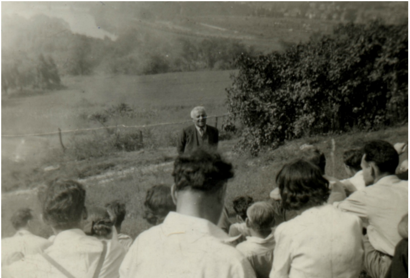
Peter Maurin speaks at a retreat at the Catholic Worker Maryfarm in Easton, Pennsylvania, in September 1940.